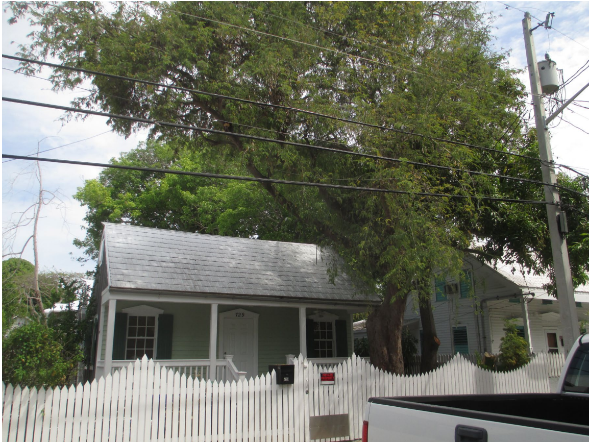
A photo of the Tamarind during an inspection on April 11, 2016 and a photo of the same Tamarind from driving by on April 7, 2025