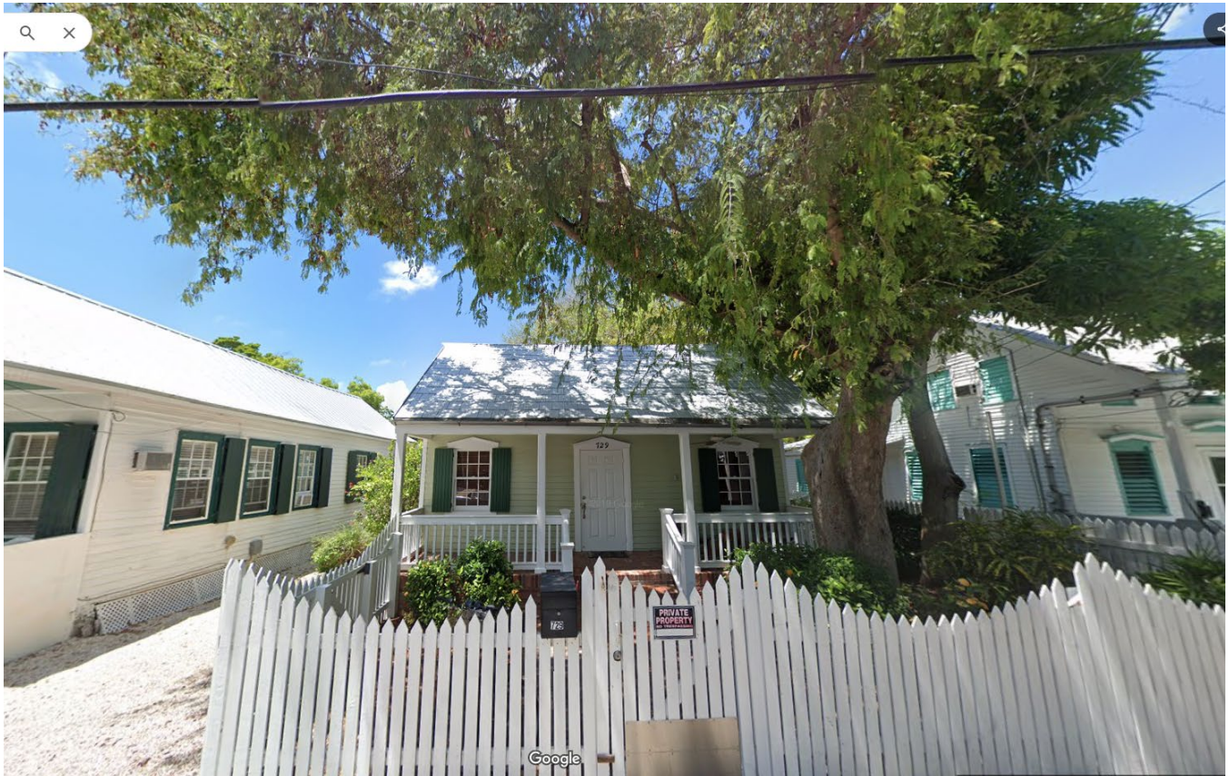
Google Street View of 729 Olivia St – 2019 – Looking at the front of the property with the Tamarind

The property owner submitted an after-the-fact application on April 8 th after the Tamarind tree had been removed requesting approval on the basis that the tree had termites and was impacting the house. I informed him that I needed to approve the approval prior to the removal, so this would be an enforcement case. During the April 23 rd inspection, the property owner and property manager stated the Spanish Limes had been like that for a while, but based on aerials, previous photos, the appearance of a new cut near Spanish Lime #1, and fresh saw dust near Spanish Lime #2, it is my determination the trees were affected at the same time as the tamarind.