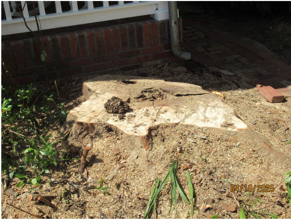
A photo of the Tamarind's remaining stump and a photo of how I measured the stump – I used the regular measurement side, not the diameter side.