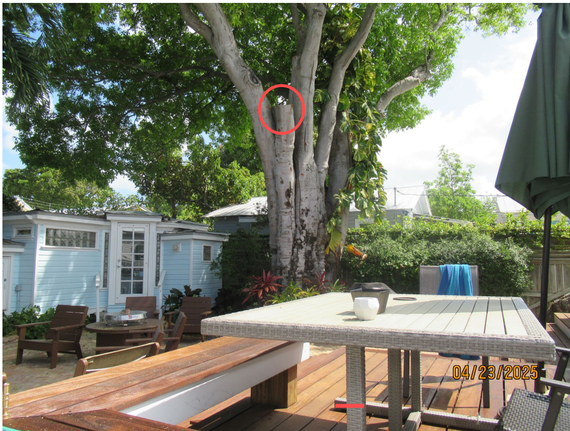
Two photos of Spanish Lime #1 taken during an inspection on April 23, 2025. I circled where the trunk that has since been removed.