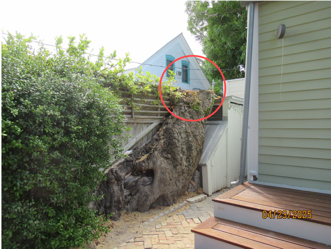
A photo of Spanish Lime #2 with the tree itself missing circled

If the Tree Commission for the City of Key West finds that there has been a violation of the above code section, it will elect to enter into a compliance settlement agreement pursuant to section 110-291 of the Key West City Code or recommend a fine and further hearing before the Special Master of the City of Key West pursuant to section 110-294 of the Key West City Code.