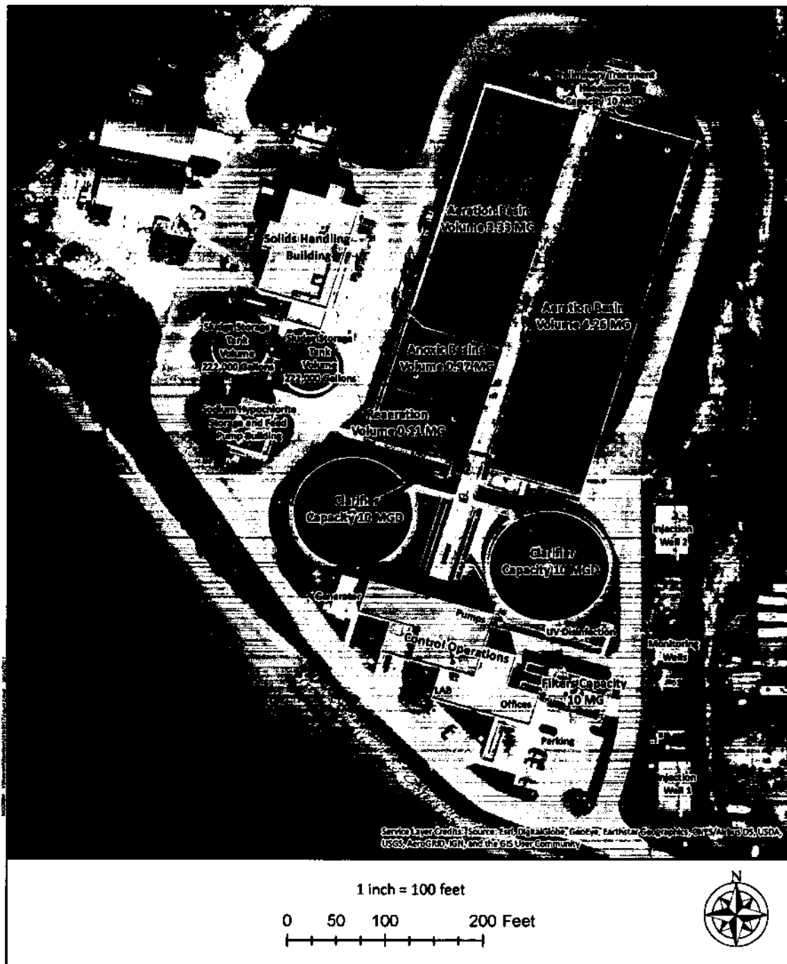
Figure 2. Site Plan