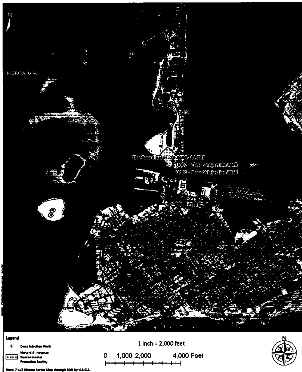
Figure. 1. Location Map