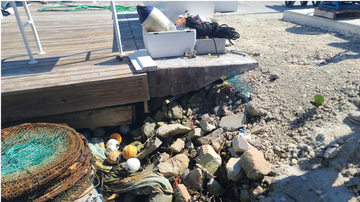
Figure 5. Lack of support and shoreline erosion along of wood frame dock. Old failing wood frame marginal dock abandoned under the new over framing.