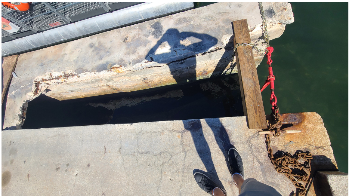
Figure 3. Same as Figure 2. Top view. Corroder reinforcement inside of the slab.