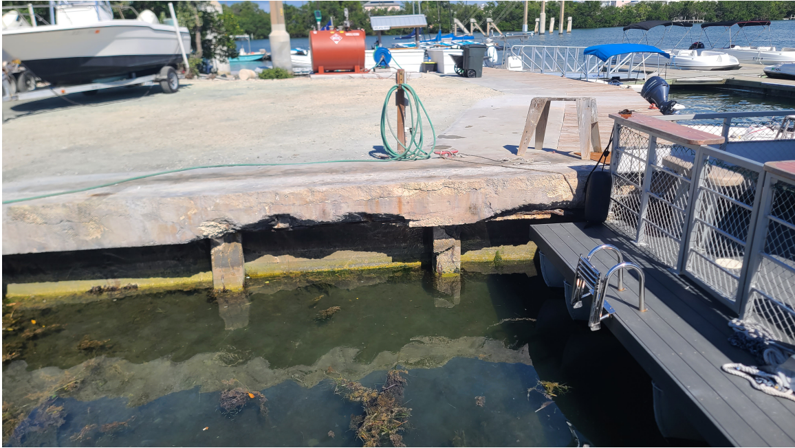
Figure 4. Concrete spalling, cracks and failure of seawall cap, soldier piles. Heavy silted dock basins require maintenance dredging.