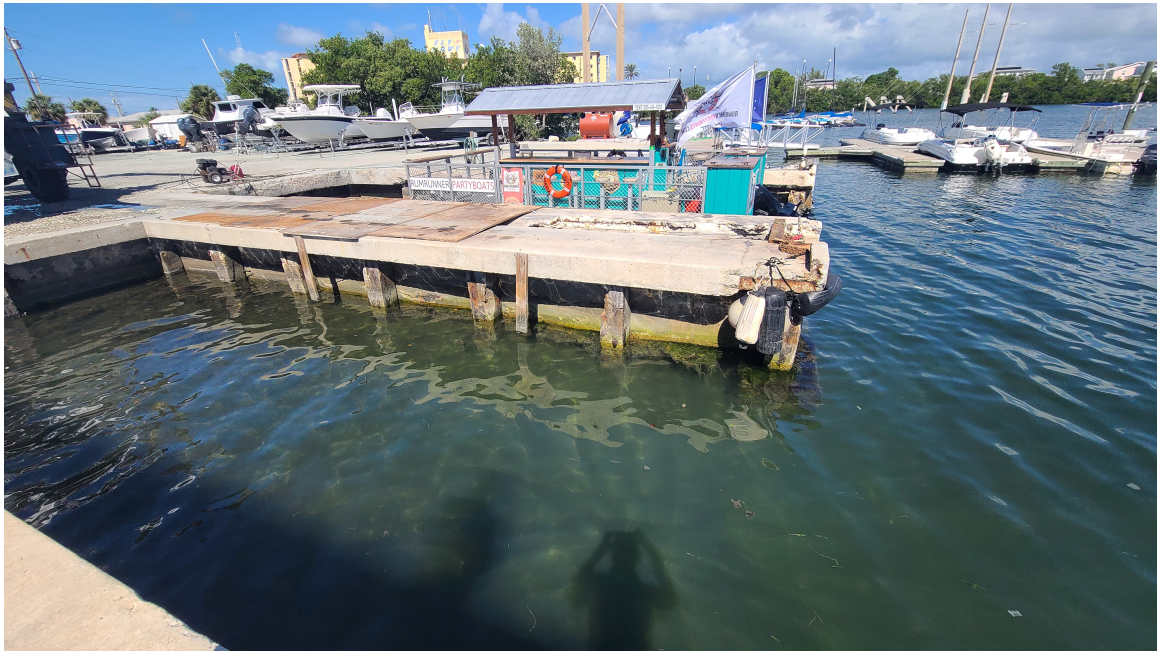
Figure 2. Severely damaged finger pier. Supporting gantry crane trucks. The core of the pier completely eroded backfill soils and seawall cap collapsed. Damaged seawall and soldier piles.