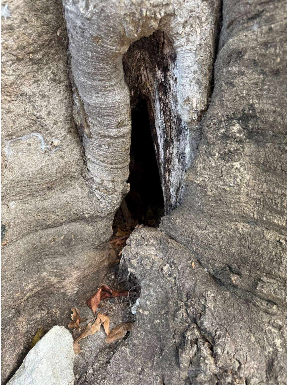
Multiple holes exposing the hollow core of the trees trunk.