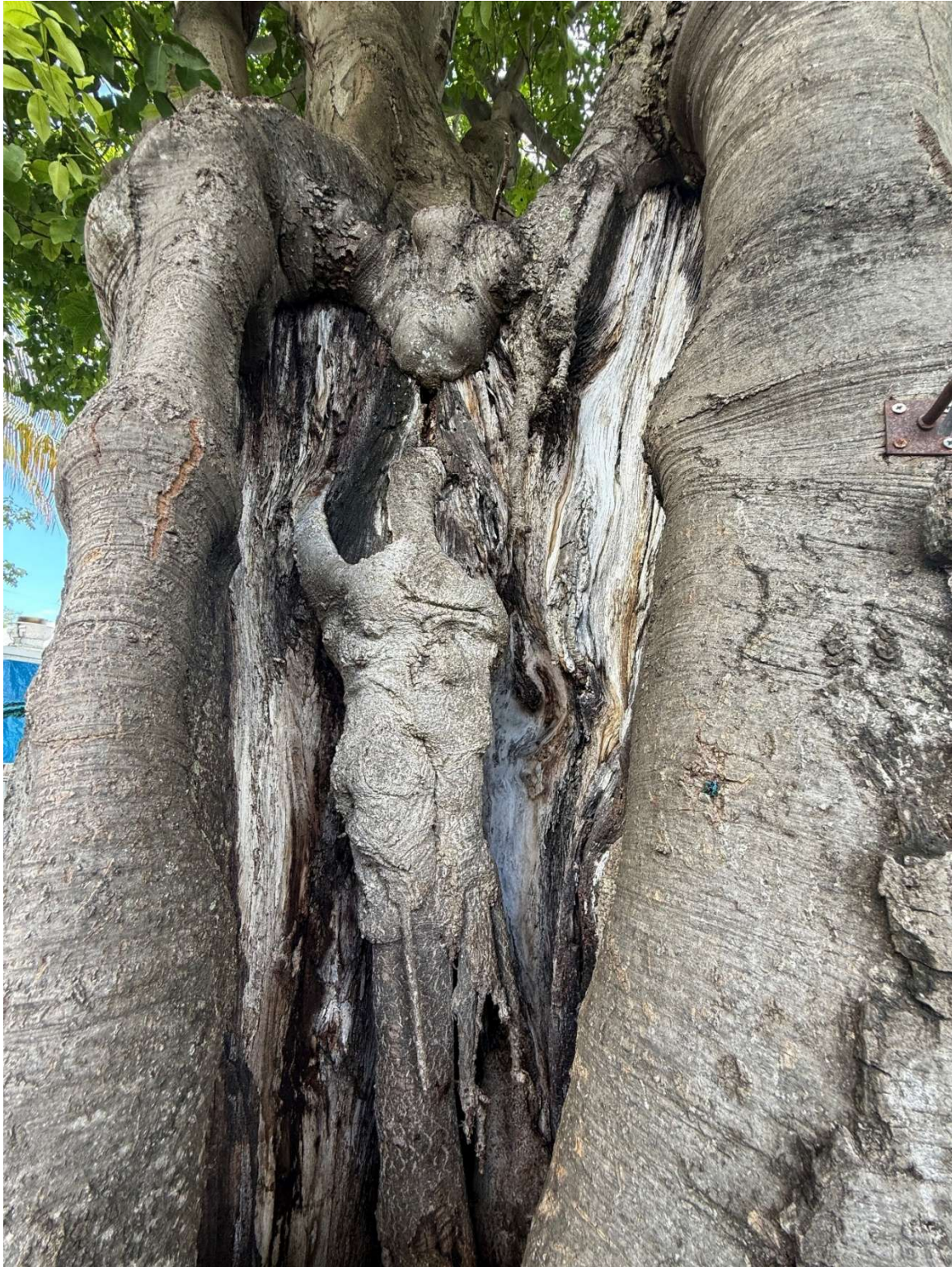
Large cavity and decayed tissue.