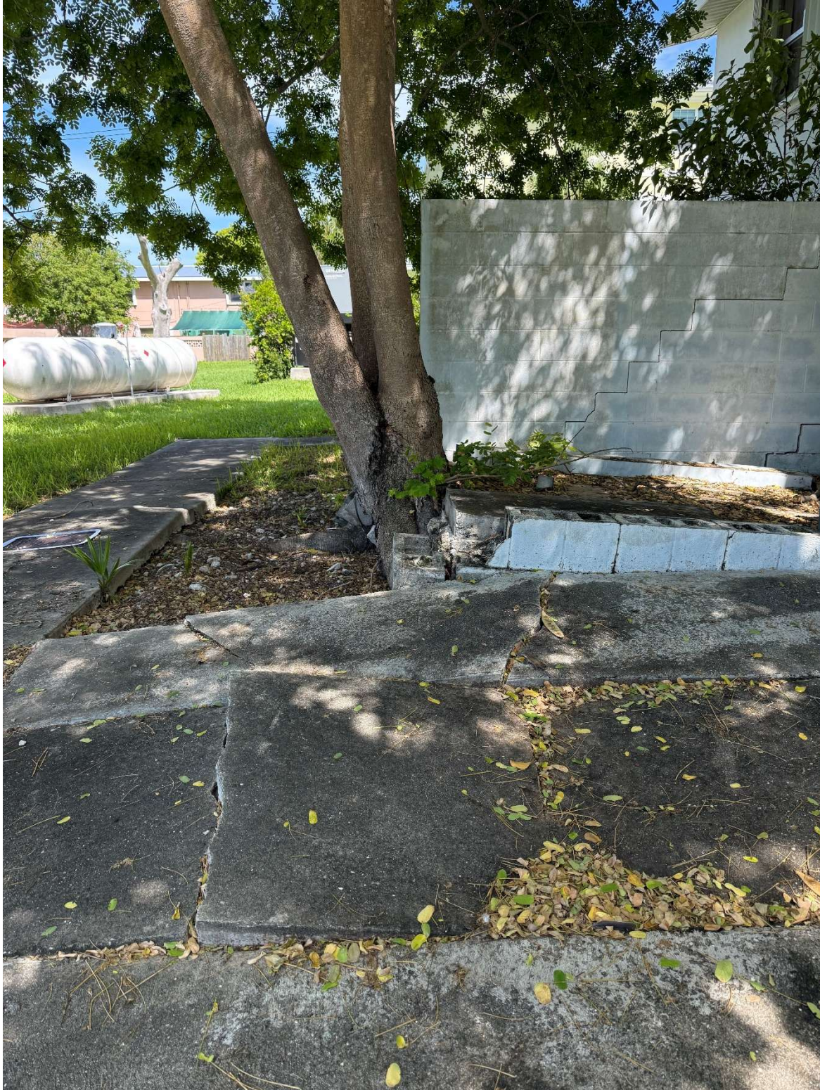
The tree's multiple stems have included bark indicating a compromised connection.