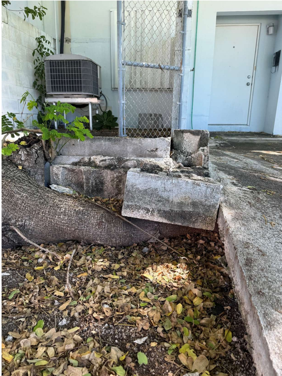
Concrete slabs on both sides are lifted causing rainwater to pitch towards the building.