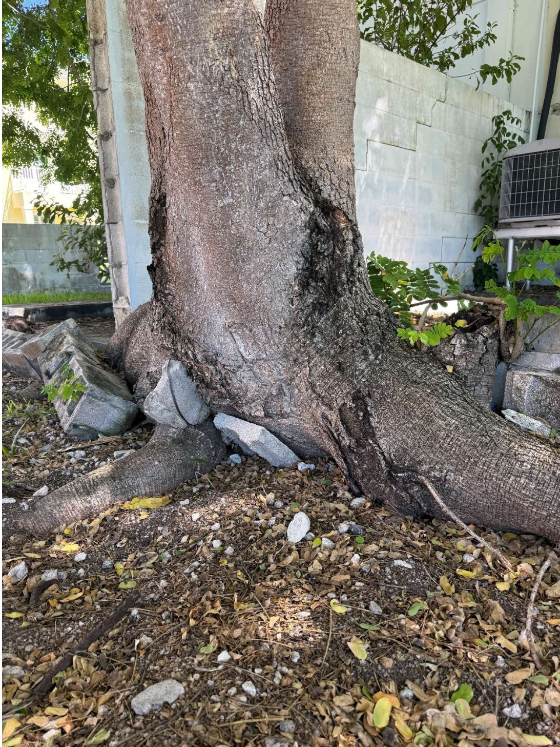
The tree's root flare has consumed cinder blocks.