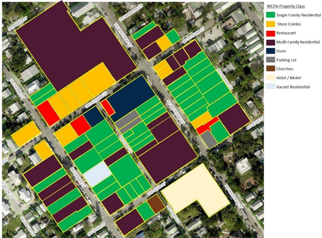
Aerial Map of the Subject Property and 300-Foot Radius of Surrounding Uses

(Balance of page intentionally left blank.)