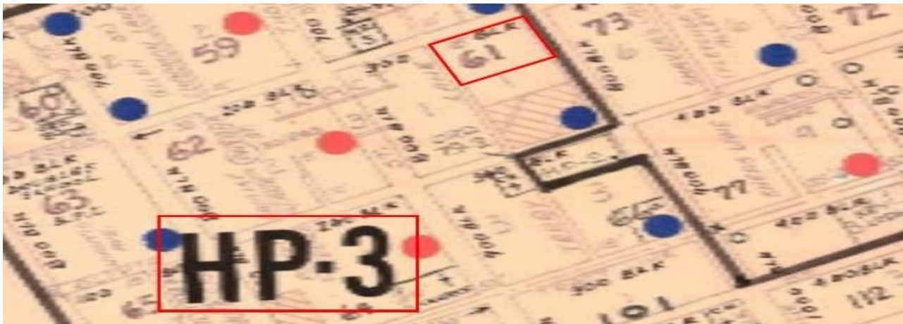
Zoning Map Prior to 1997

The property also falls within two zoning districts on the Official Zoning Map of the City of Key West (HNC-3 and HMDR). Prior to 1997, the zoning for the property was HP-3 (Light Commercial Historic Preservation) (see image below).