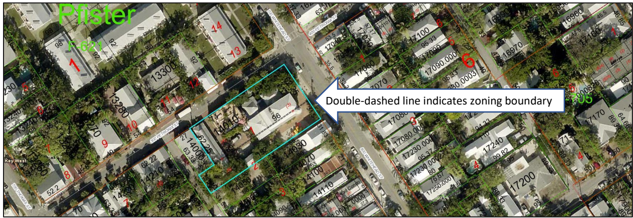
Aerial Map of the Subject Property

The property also falls within two zoning districts on the Official Zoning Map of the City of Key West (HNC-3 and HMDR). Prior to 1997, the zoning for the property was HP-3 (Light Commercial Historic Preservation) (see image below).