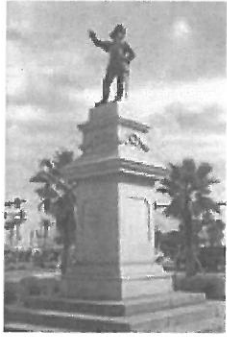
Ponce at St. Augustine.jpg 595K