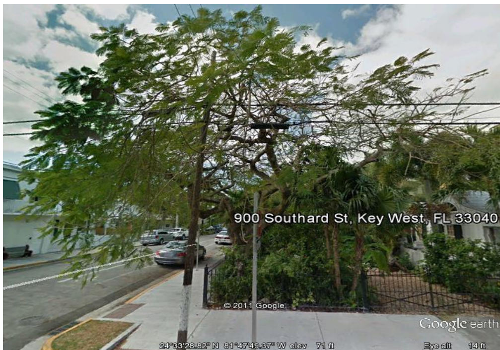
View looking west down Southard St. at Royal Poincianna Tree. Photo taken in December 2010.