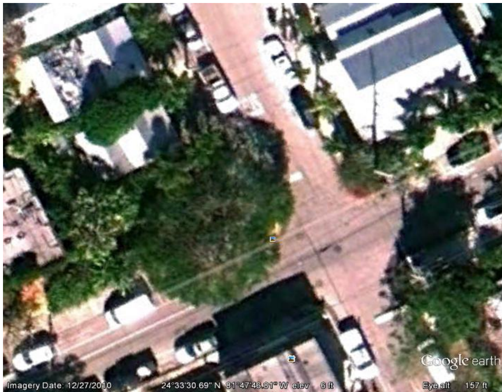
Close up view of Royal Poincianna Tree.