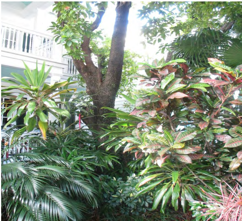
Tree #2 - 34 inches dbh