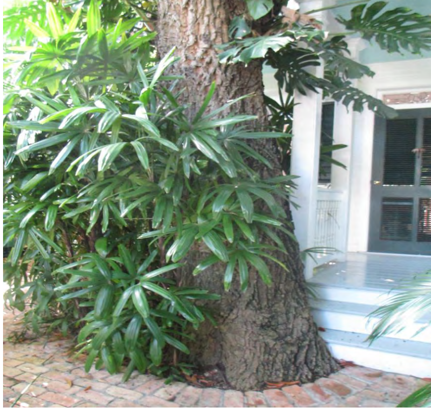
Tree #1 - 28 inches dbh