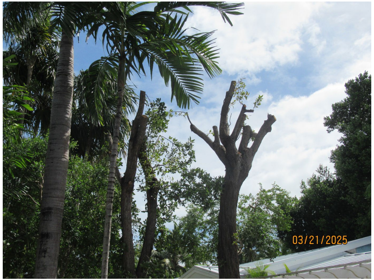
A photo of the other (2) Buttonwoods with their canopies removed.