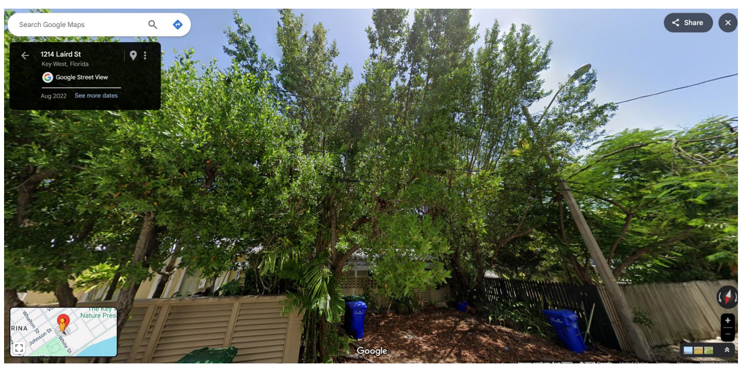
August 2022 Google Streetview of 1214 Laird St