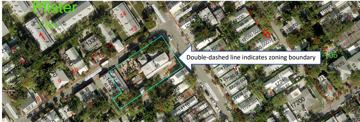
Aerial Map of the Subject Property

The aerial image (see image below) shows the dividing line, with the top portion of the parcel within the HNC-3 district and the bottom portion of the parcel within the HMDR district.