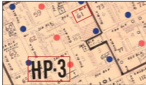
Zoning Map Prior to 1997

The new Future Land Use Map maintained the residential FLUM category that the property at 318-324 Petronia Street (802-806 Whitehead Street) partially had since the 1994 Comprehensive Plan and the 1997 Land Development Regulations. Prior to that, the property was zoned HP-3 (illustration below), which allowed residential uses as-of-right and allowed commercial and institutional uses as a special exception (similar to a conditional use).