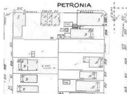
The Sanborn Map of 1960

KEY WEST MONROE COUNTY, FLORIDA NEW REPORT, OCTOBER, 1960