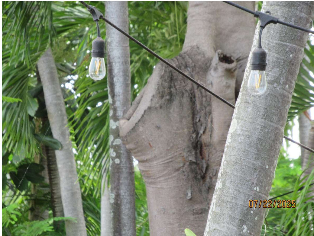
Photo of the crotch where the tree had a large limb many years ago.