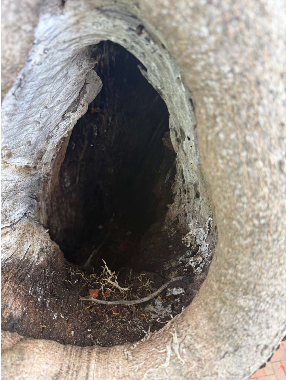
An empty trunk about half way up the tree.