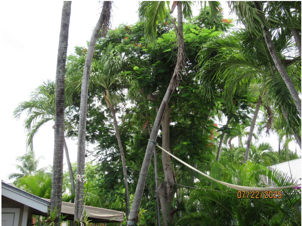
Photo of the tree standing at the front gate.