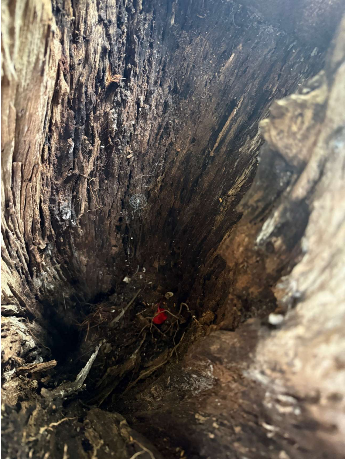
Detritus in the trunk from years of decay.