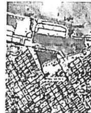
LOCATION MAP - NTS SEC. 25-T685-R25E