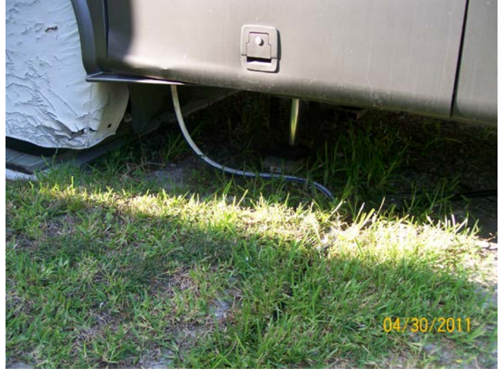
RV #6 – water line (white hose w/blue line)