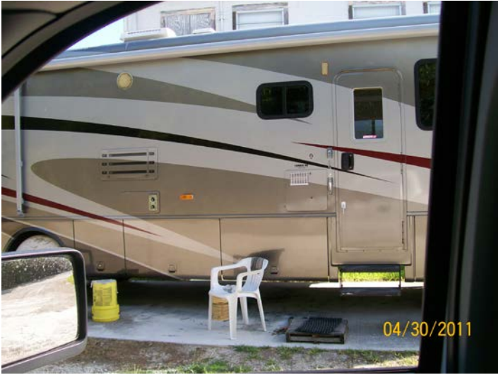
RV #6 – close up, side