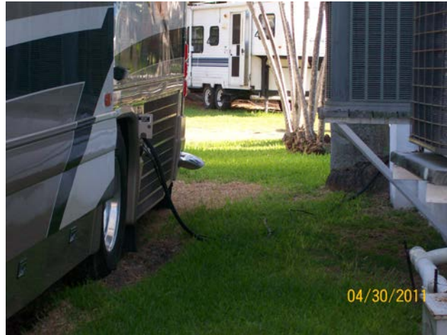
RV #5 – rear (hookup of satellite & electric coming out of RV)