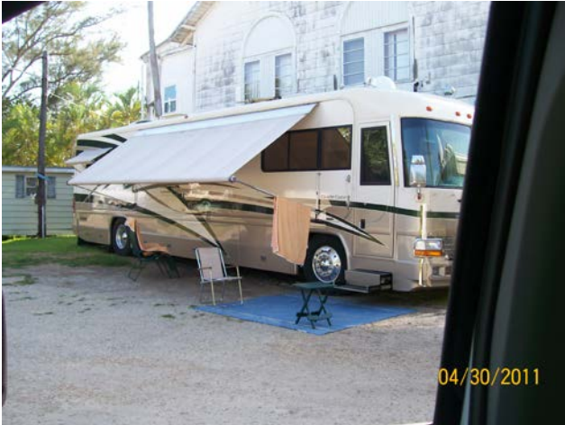
RV #5 – close up