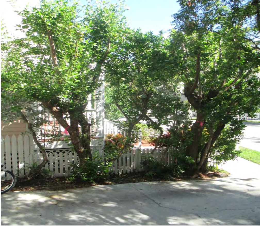
Green Buttonwood Tree # 1 & # 2