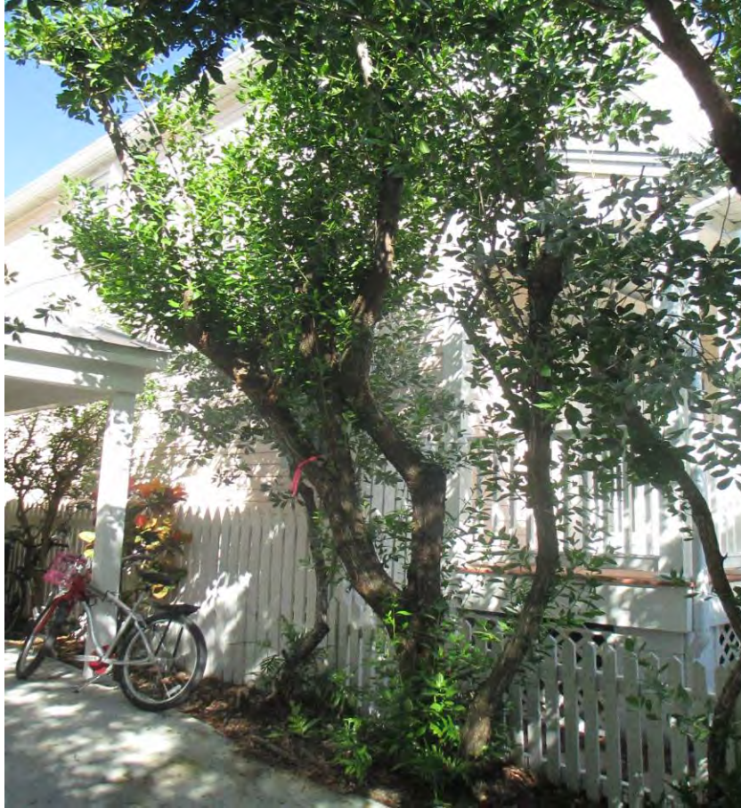
Green Buttonwood # 1

Diameter: Wild Tamarind - 7 inches dbh Green Buttonwood # 1 9.5 inches dbh Green Buttonwood # 2 8.5 inches dbh Total dbh 25 inches dbh