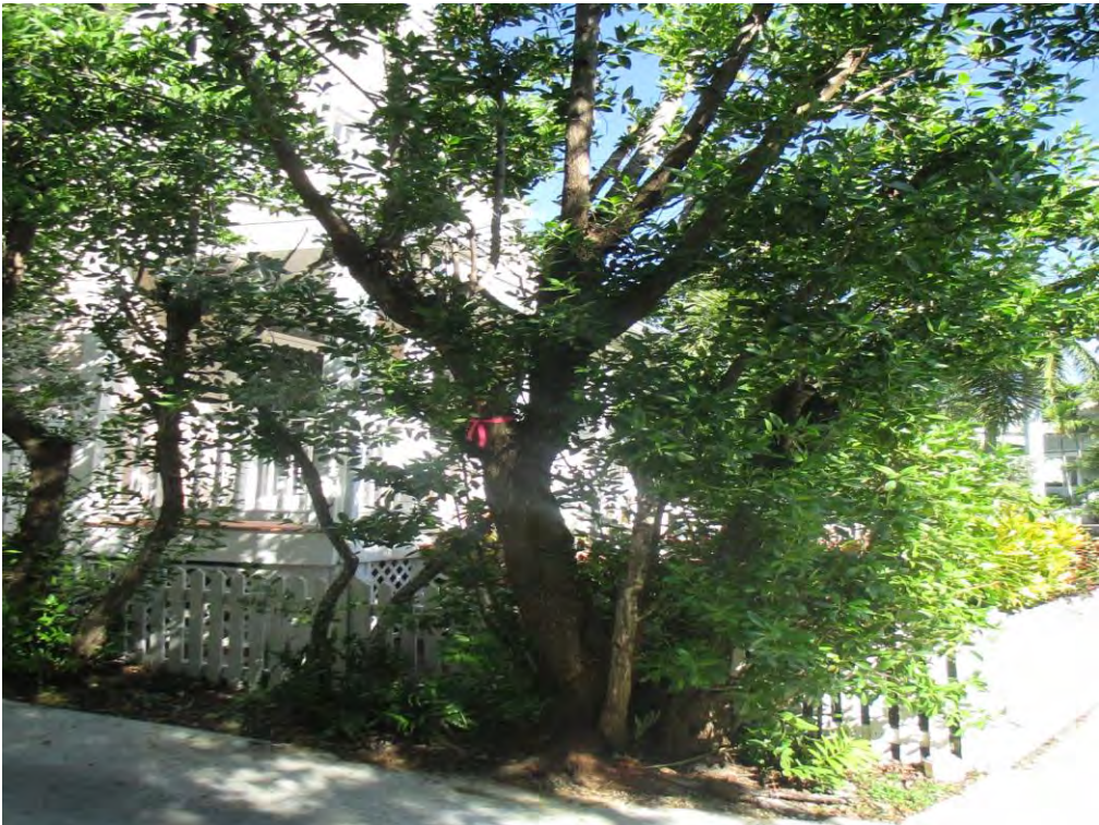
Green Buttonwood # 1