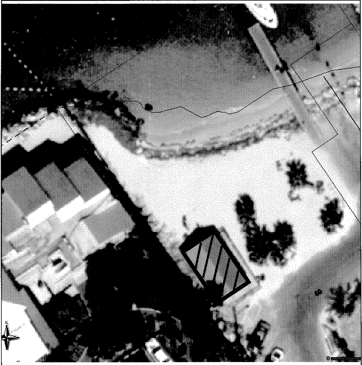
EXHIBIT A - 252 Square Feet