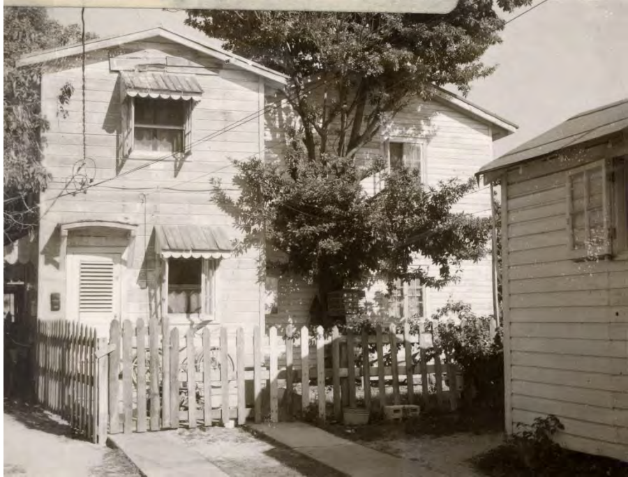
Buildings circa 1965.