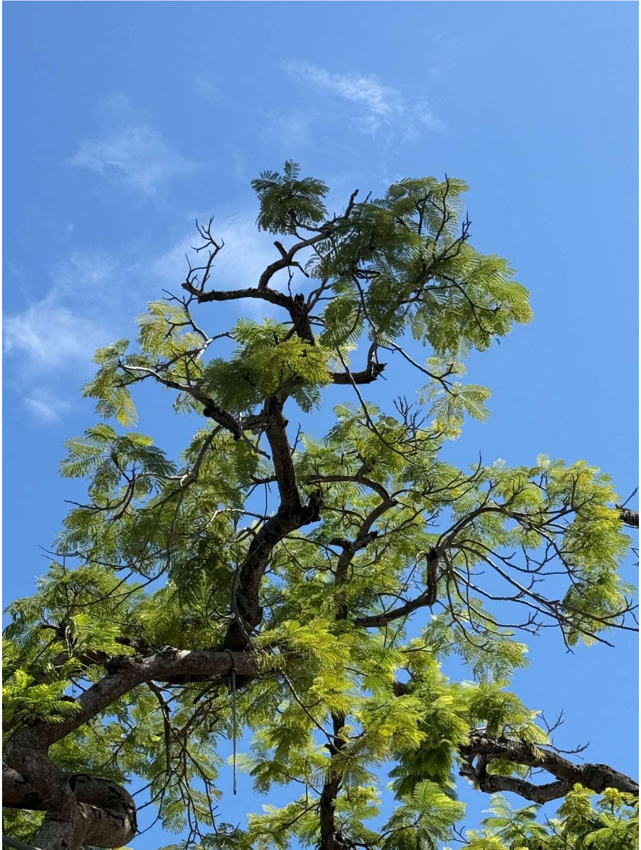
The canopy has severe dieback.