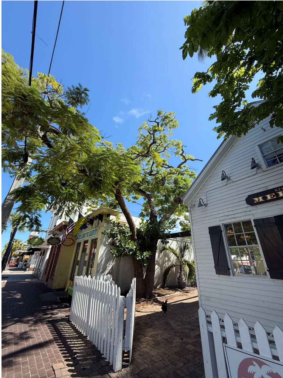
The only descent canopy left is entangled in communication lines.