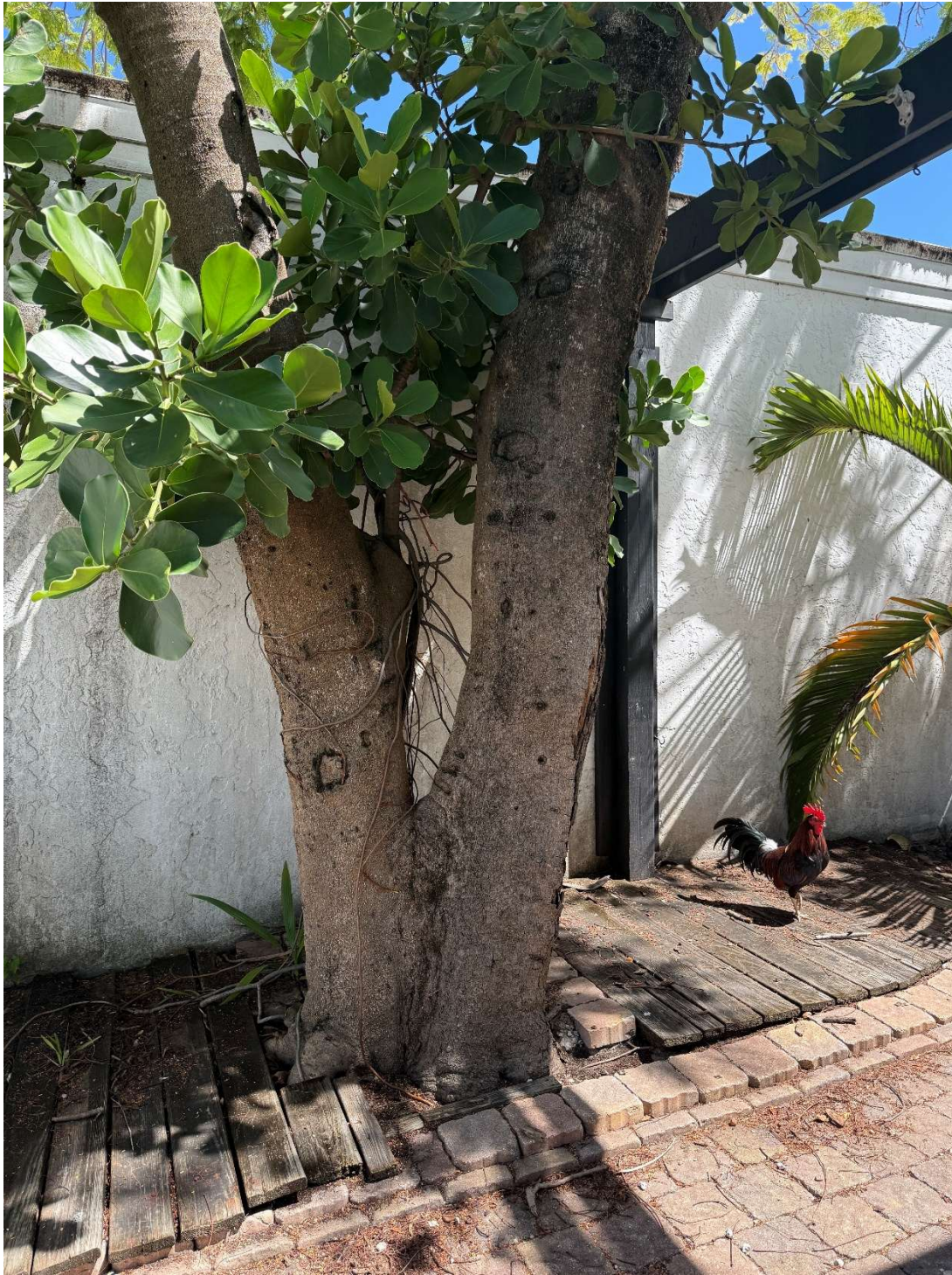
The tree is growing less than 2 feet from the building.