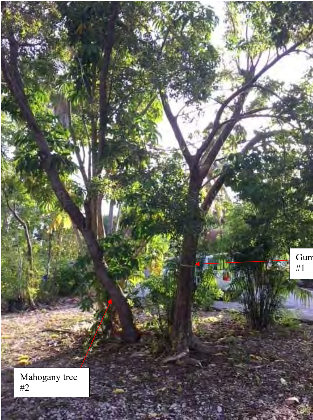
Mahogany tree #2