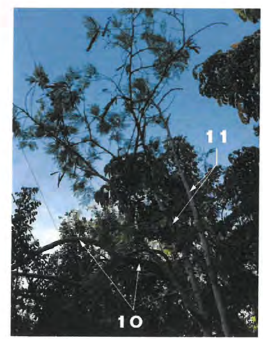
Tree No. 10