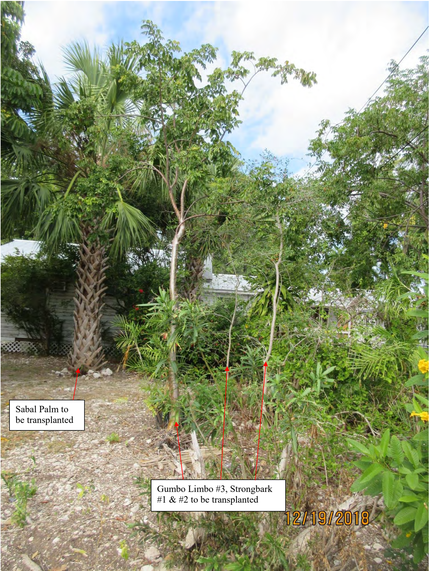
Sabal Palm to be transplanted