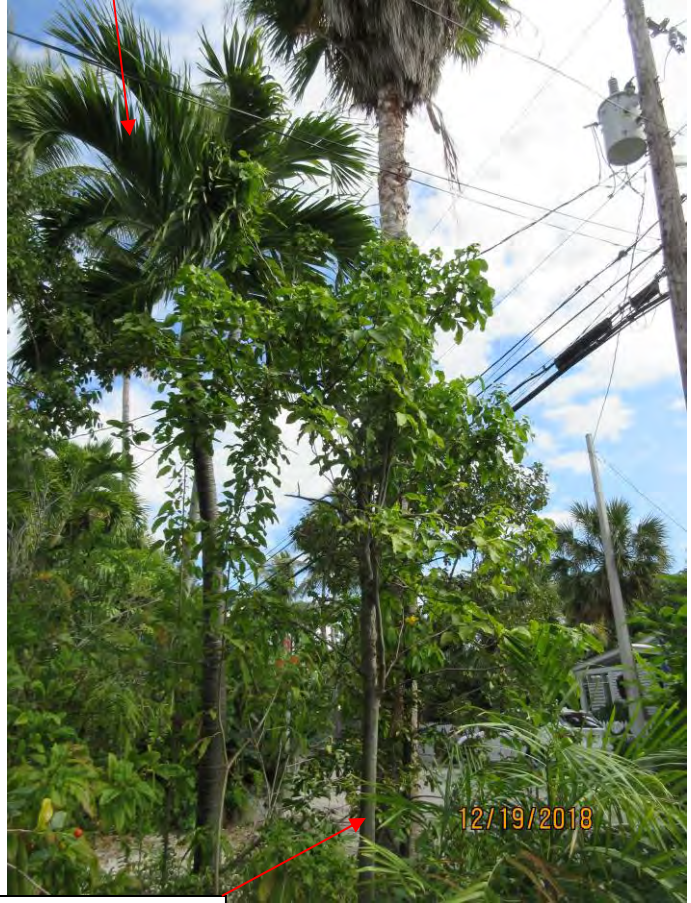
Spanish Lime to be transplanted