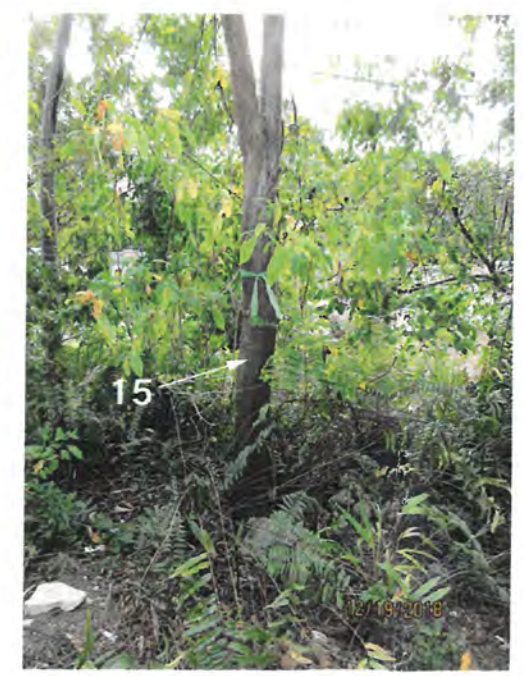
Tree No. 15