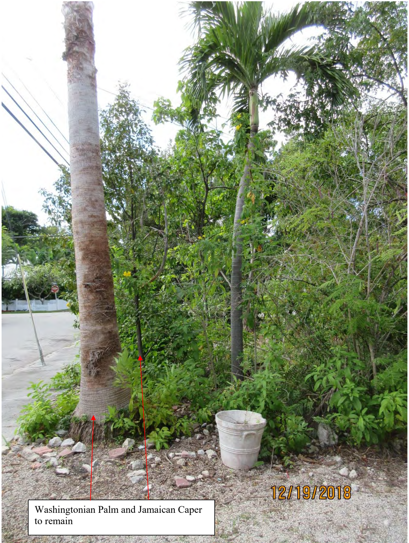
Washingtonian Palm and Jamaican Caper to remain