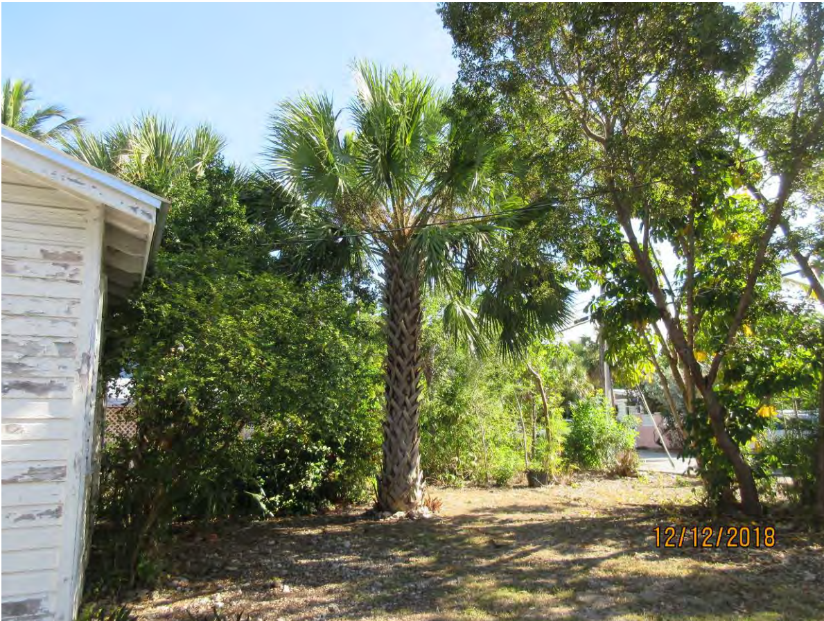
Another view of Sabal Palm to be transplanted