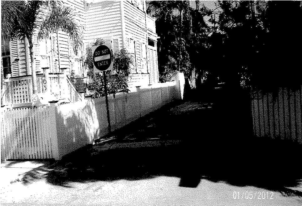
405 Frances case # 11-1506 Fence encroaching on city's row