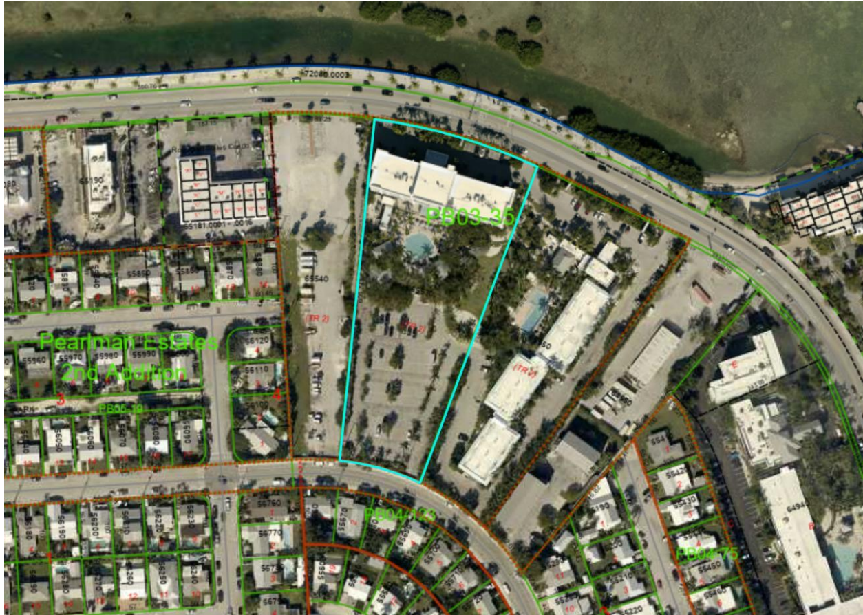
Aerial of the Subject Property