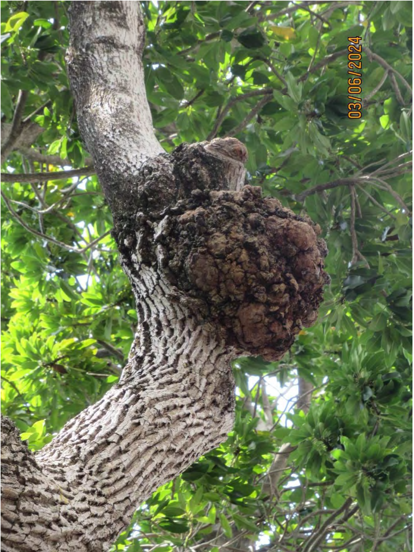
Photo of interior canopy showing gall growth, view 1.