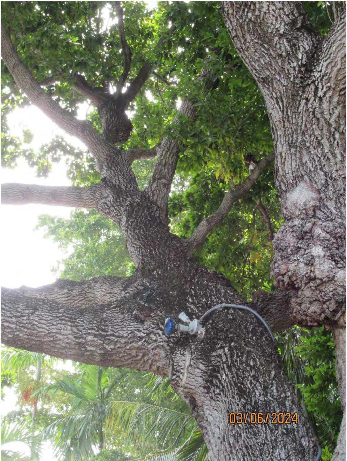
Photo of tree canopy, view 5.