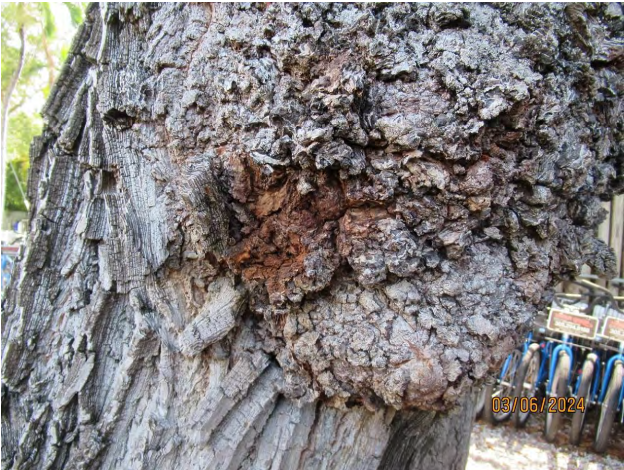
Photo of gall on main trunk.