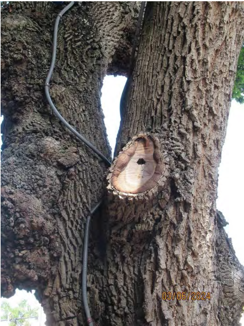
Photo of main trunk.