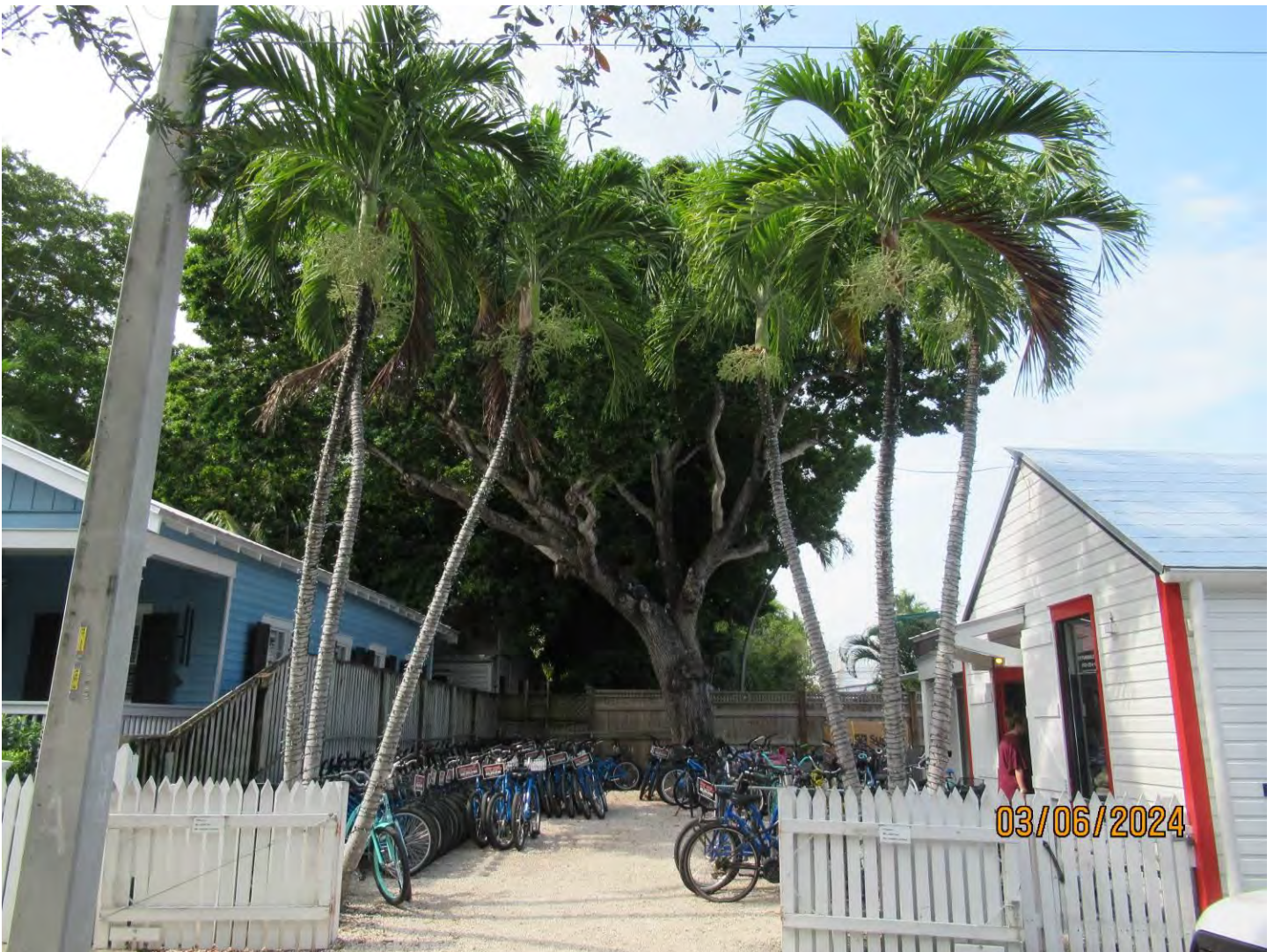
Photo of whole tree showing location.

Tree Species: Sapodilla ( Manilkara zapota )