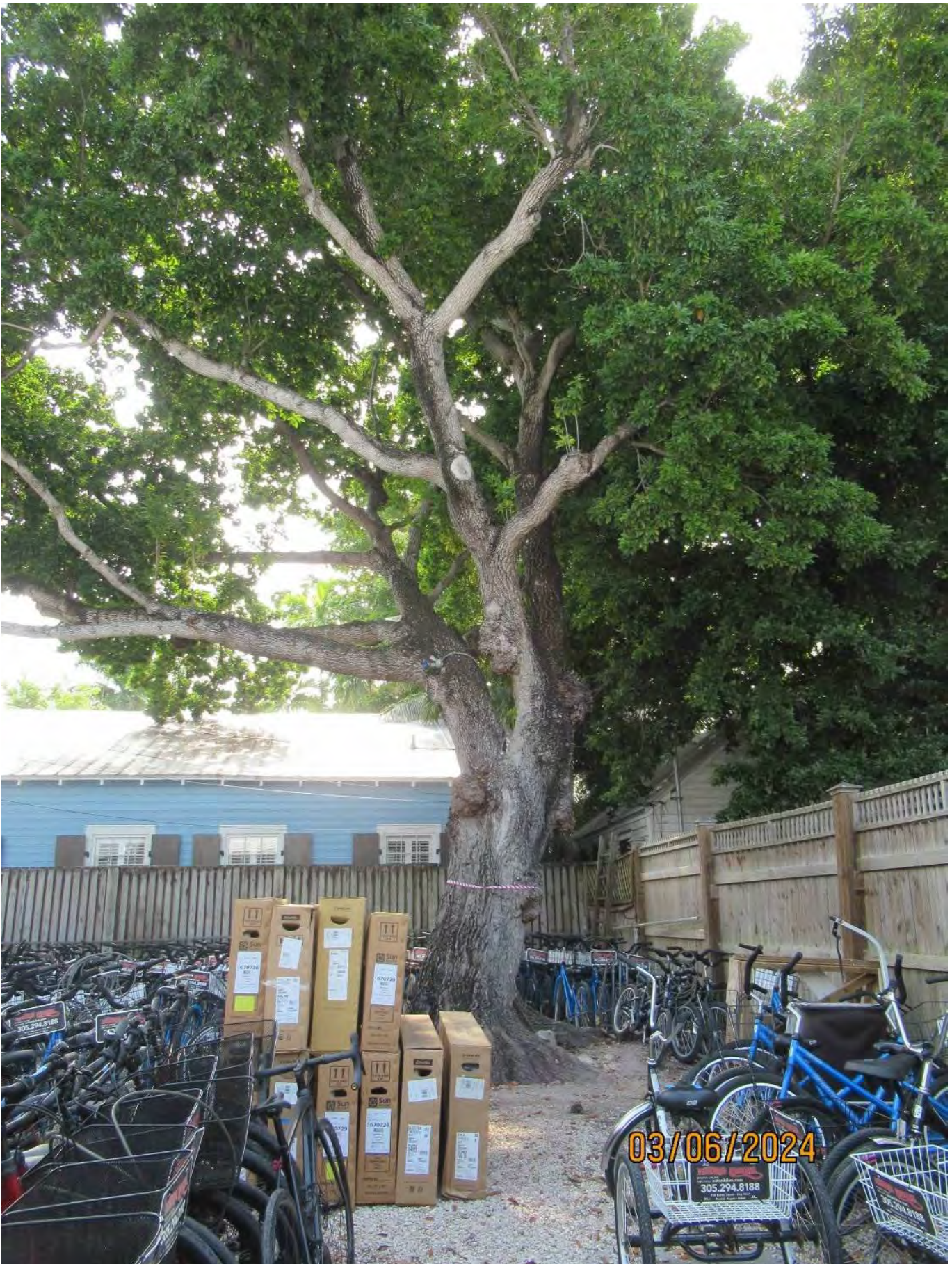
Photo of tree trunk and canopy, view 4.