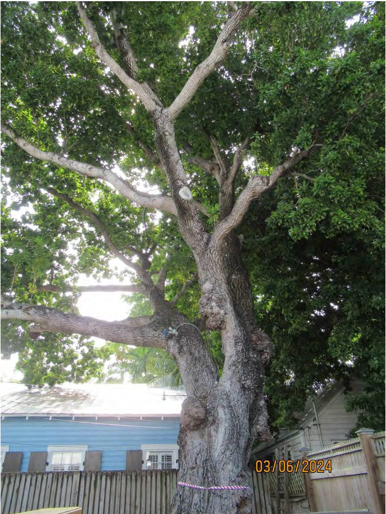
Photo of tree trunk and canopy, view 1.