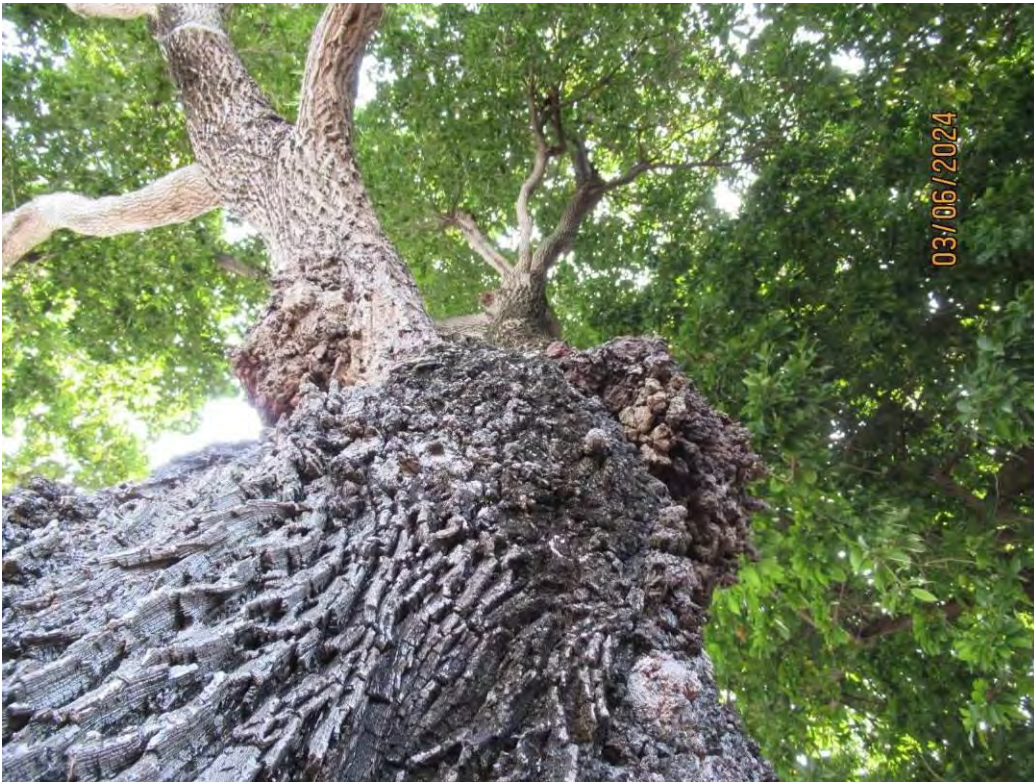
Photo of tree canopy, view 3, looking up main trunk.