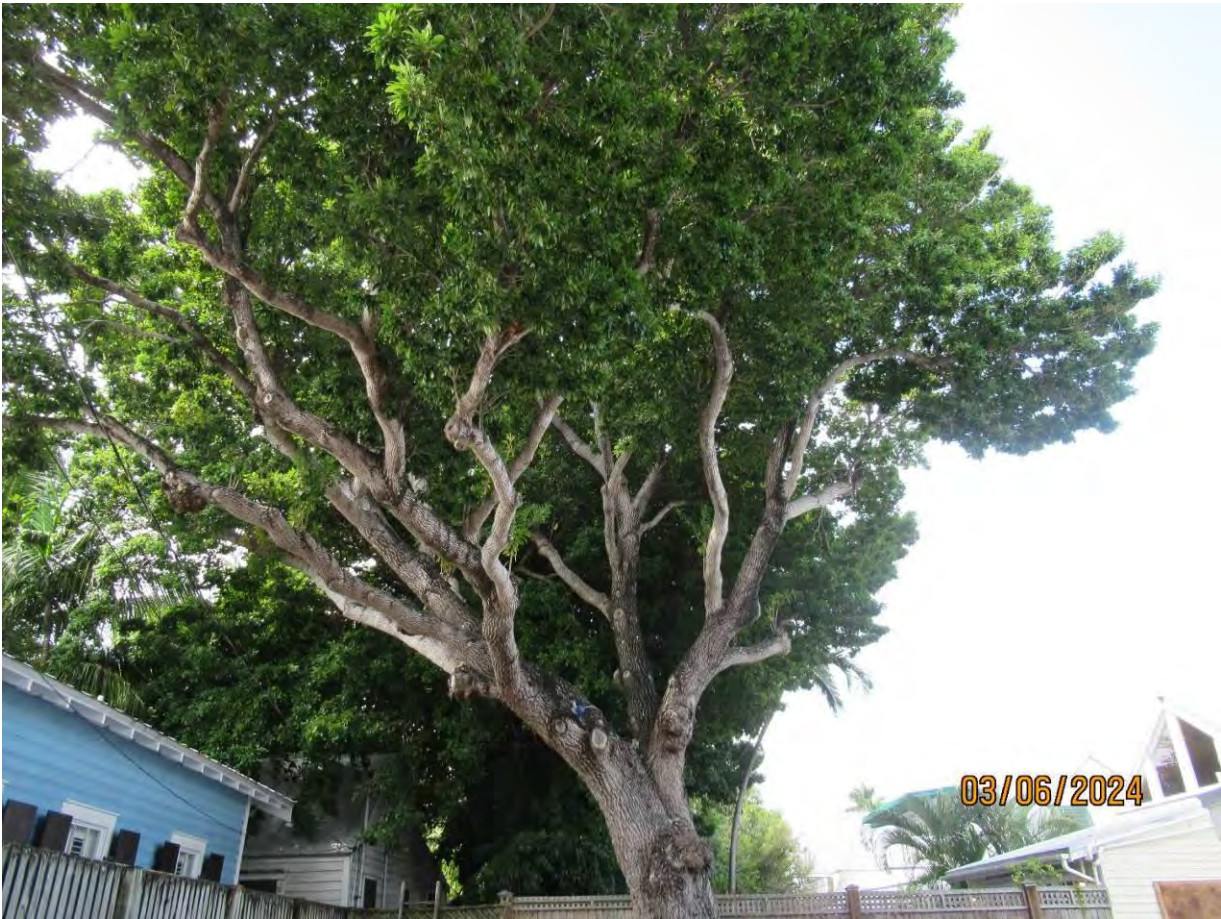
Photos of tree canopy, views 1 & 2.