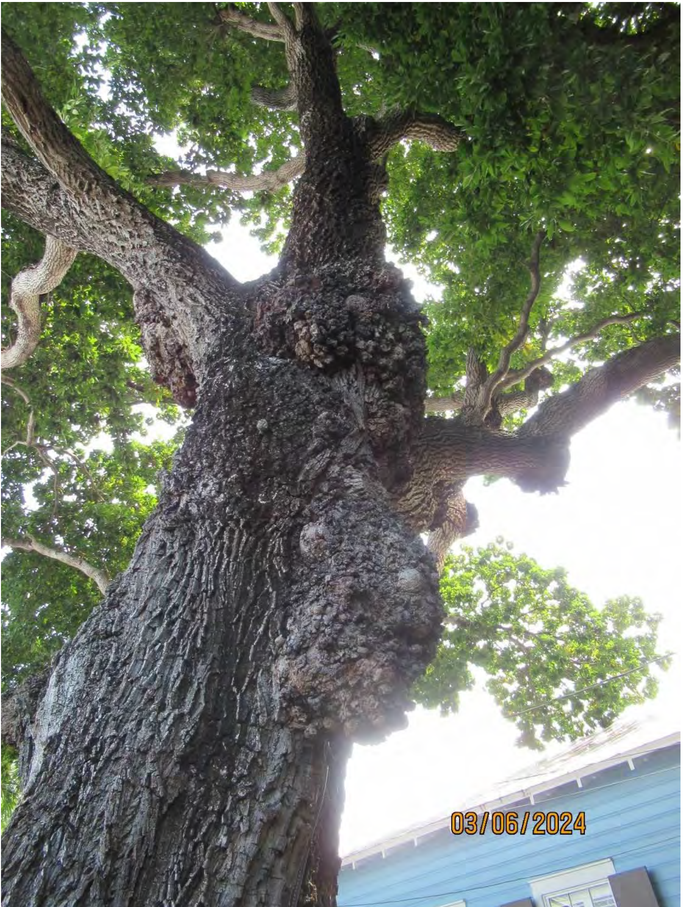
Photo of tree trunk and canopy, view 2.