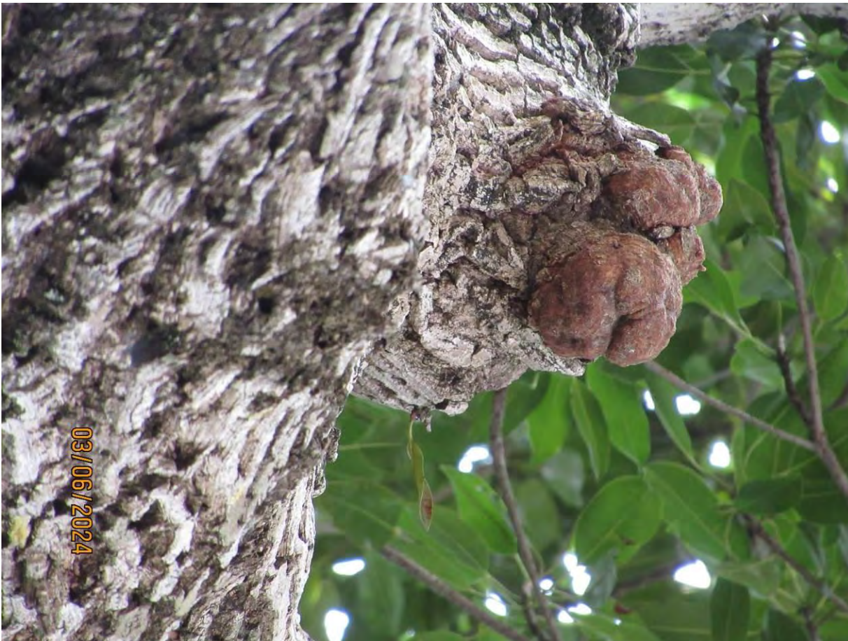
Close up photo of woody growth at cut/break area in tree canopy.