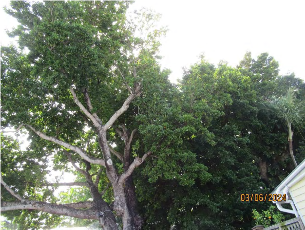
Photo of tree canopy, view 7.