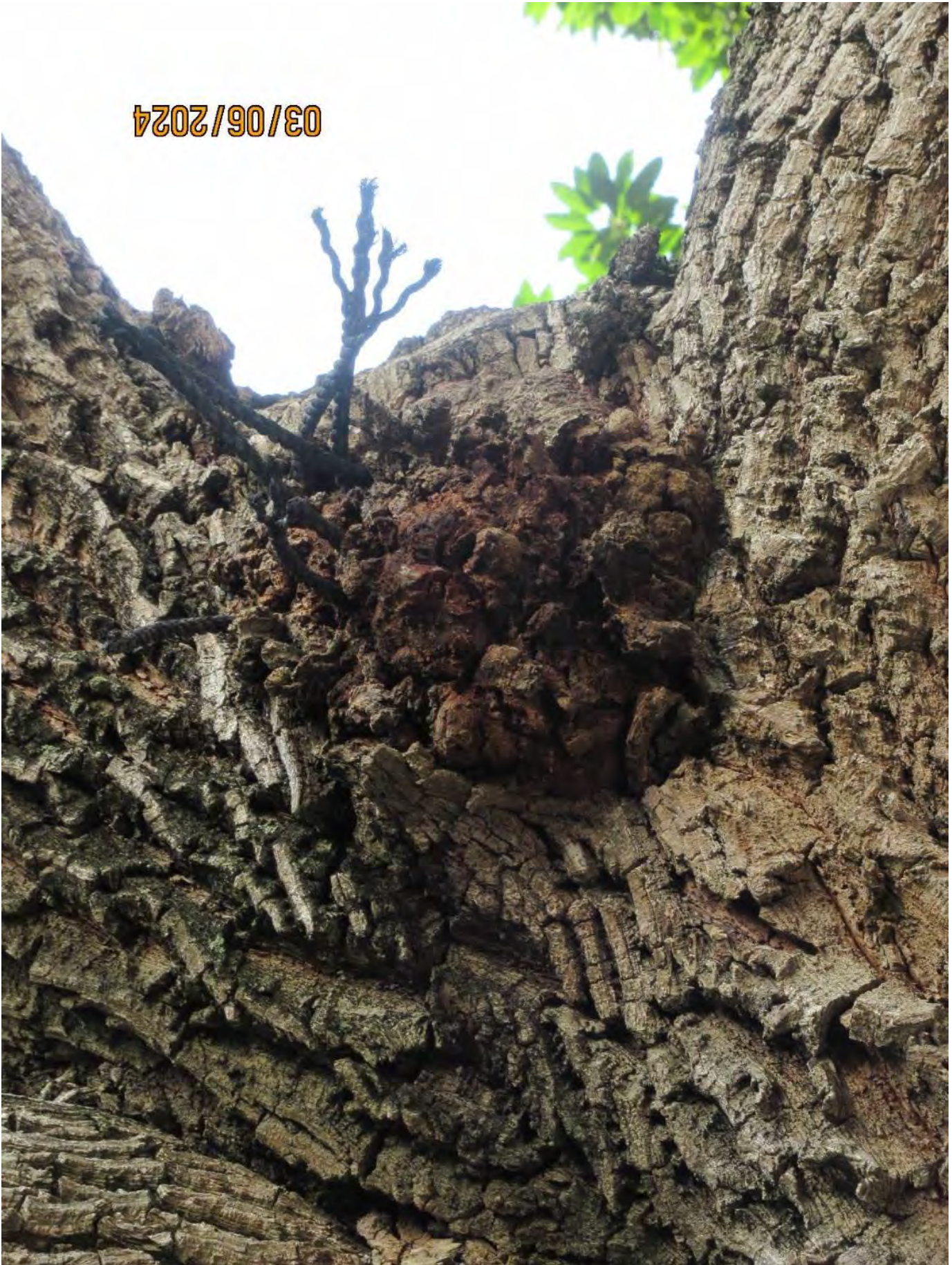
Photo of crotch area with gall.