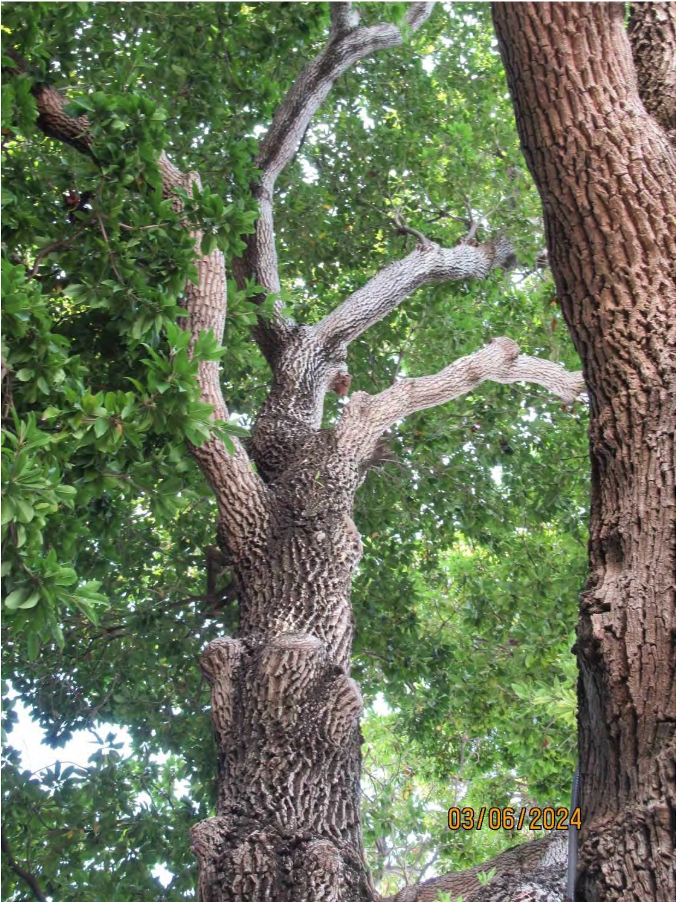
Photo of tree canopy, view 4.