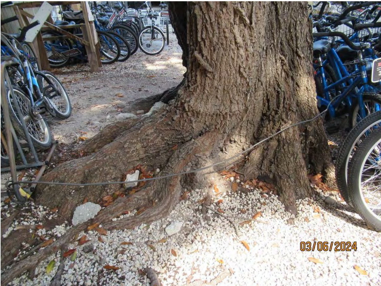
Two photos of base of tree, views 1 & 2.