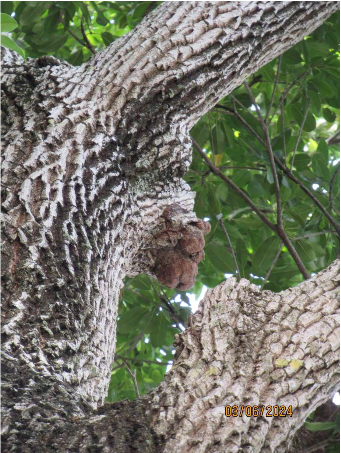
Photo of interior of tree canopy, view 3.