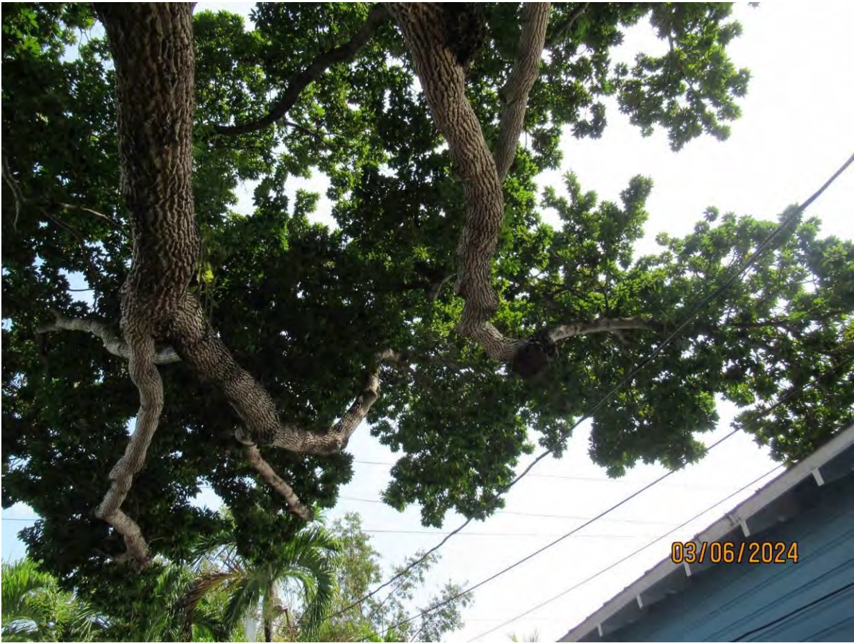
Photo of tree canopy, view 6.