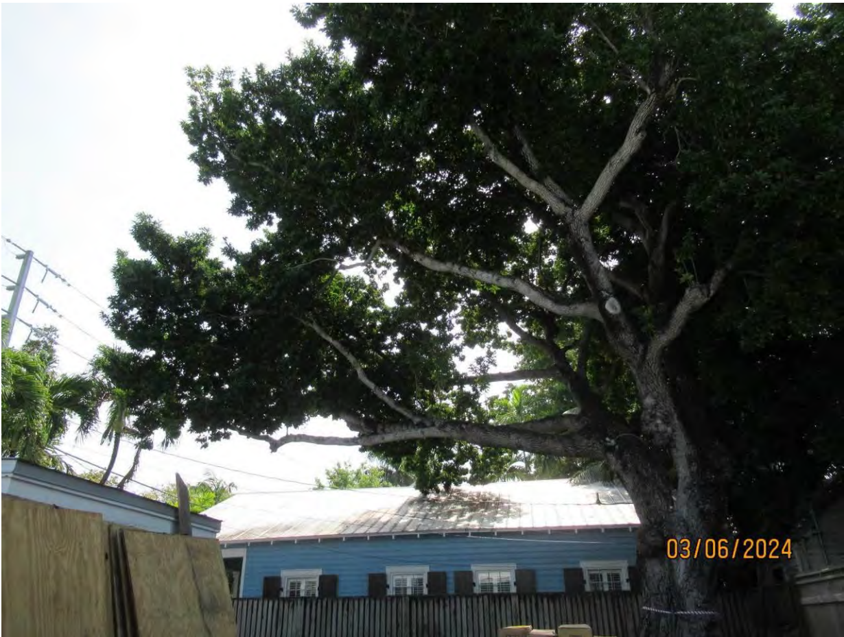
Photo of tree trunk and canopy, view 3.