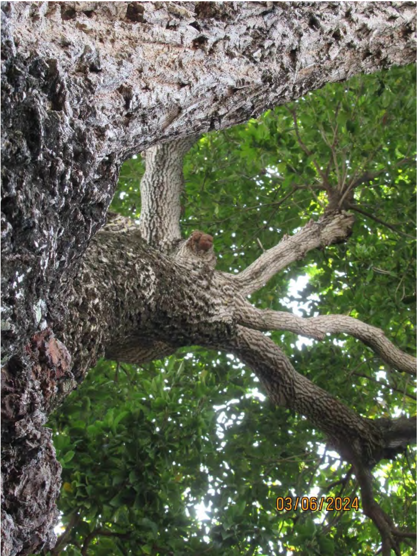
Photo of interior of tree canopy, view 2.