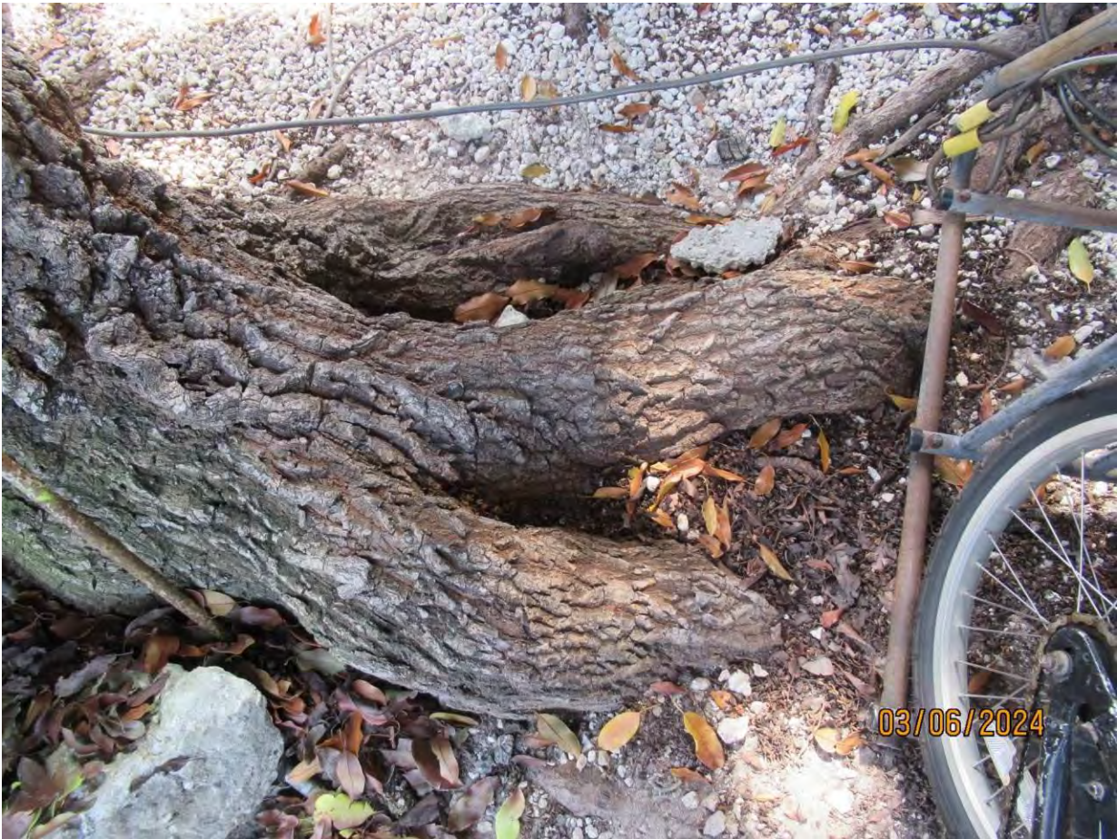
Photo of base of tree, view 3.