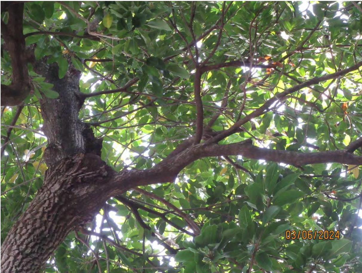
Photo of interior of tree canopy, view 1.