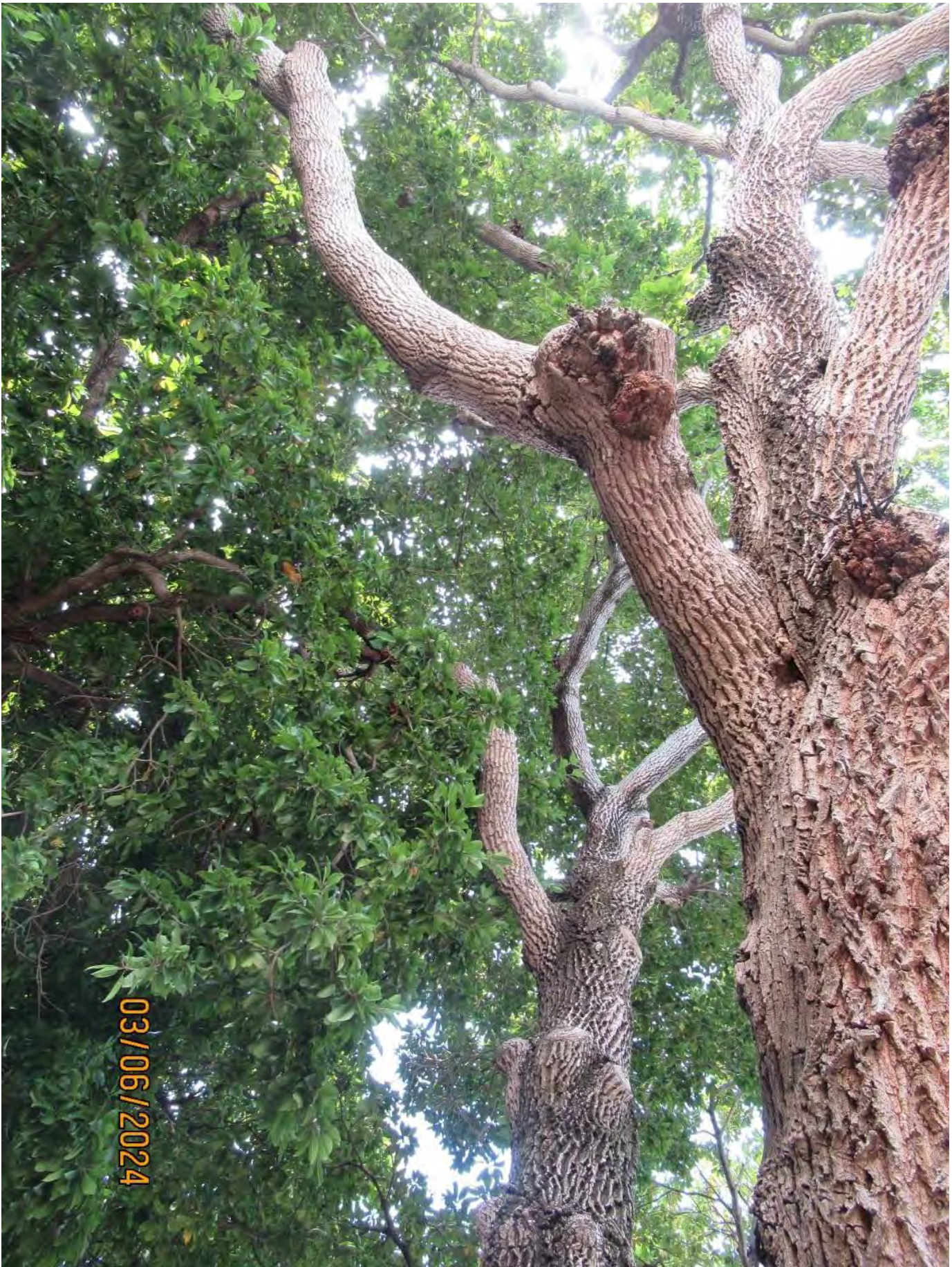
Photo of interior tree canopy, view 4.