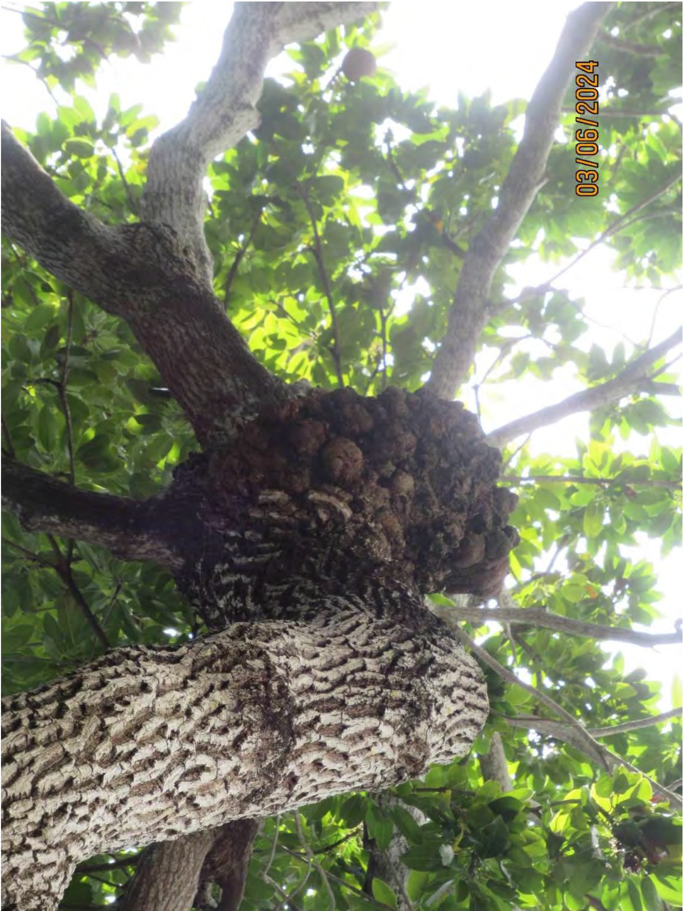
Photo of interior canopy showing gall growth, view 2.