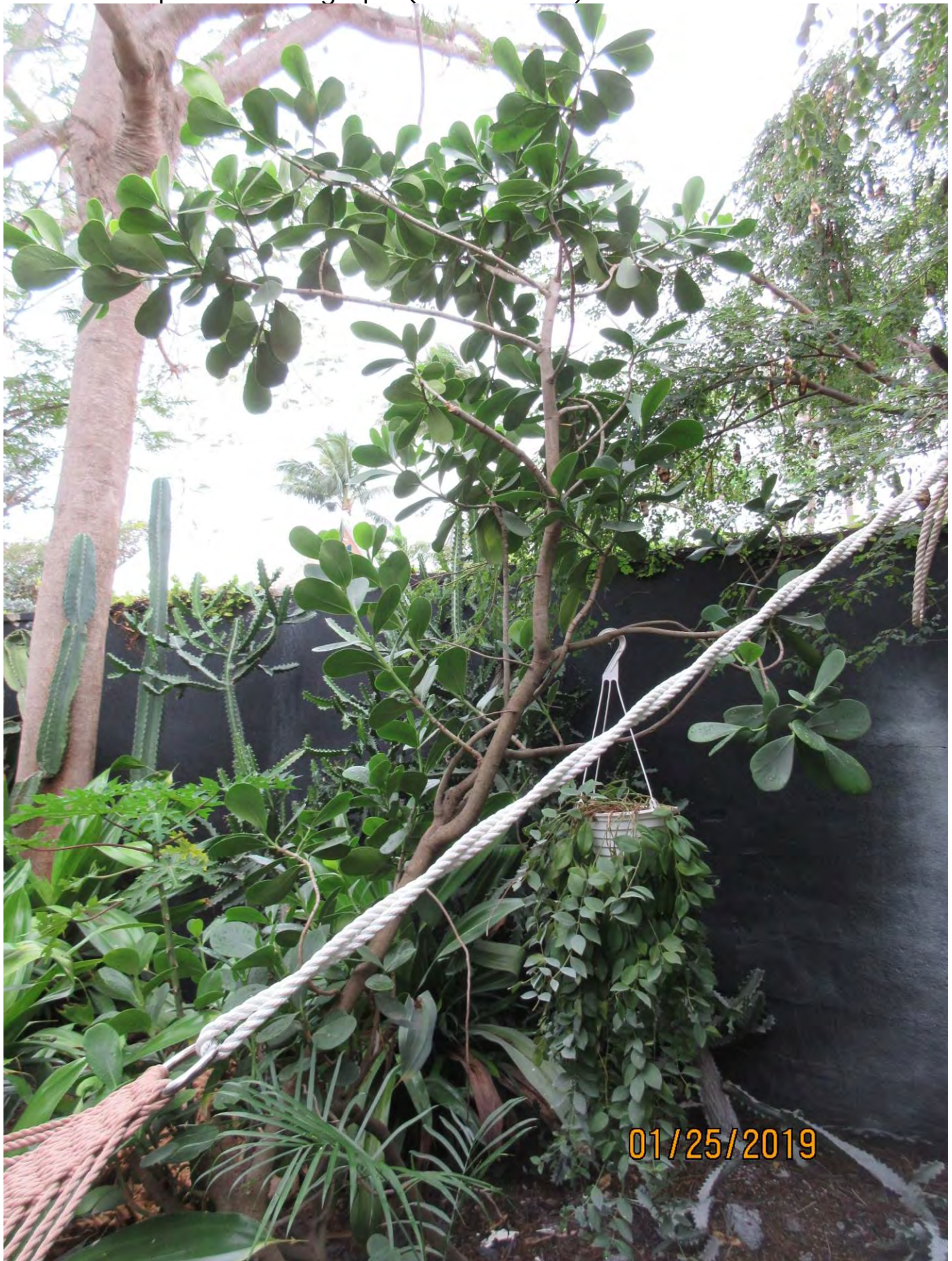
Tree Species: Autograph ( Clusia rosea )