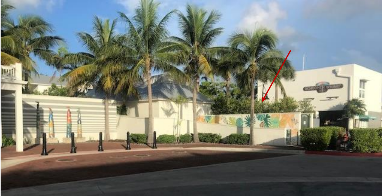
View from Margaret Street