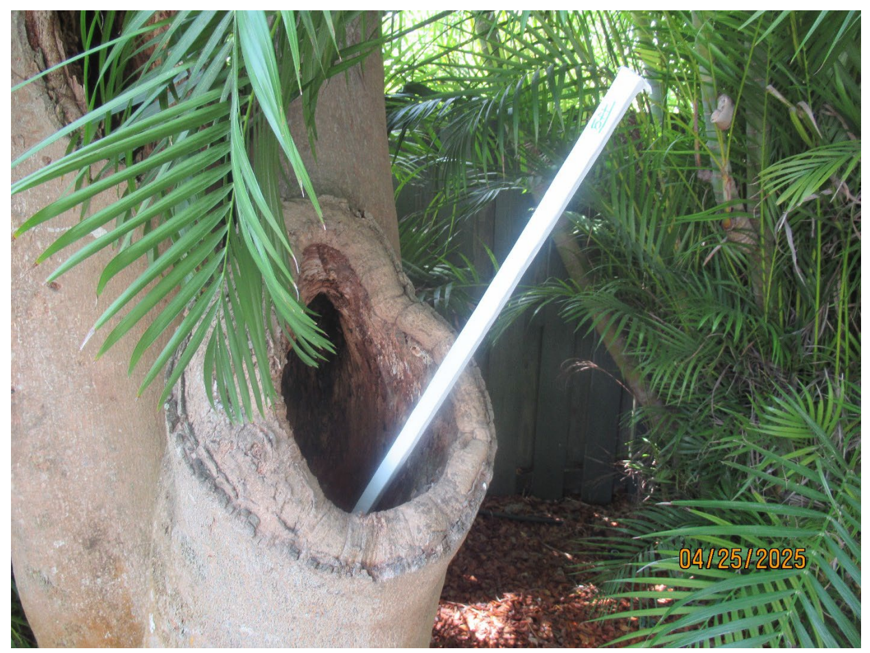
A photo of a 5ft stick in the lowest hollow area and a photo of of the stick going up into the trunk