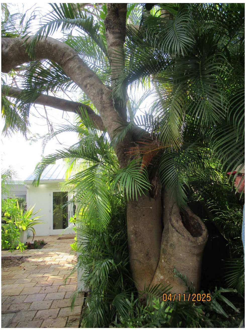
A photo of the tree overall