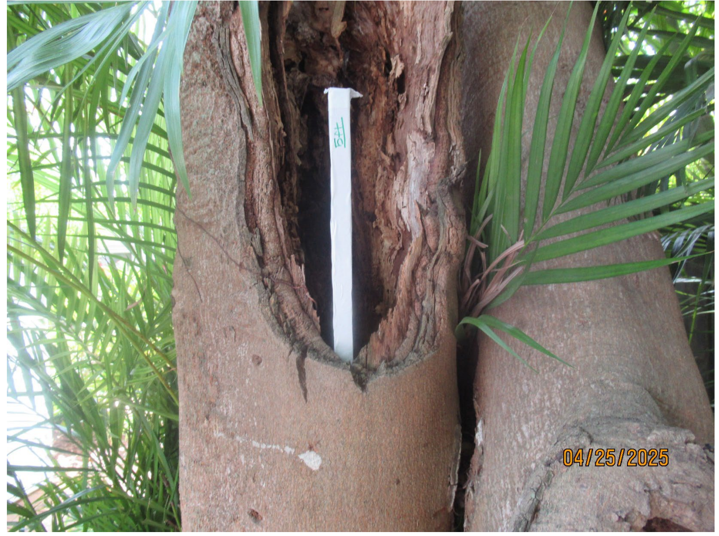
A photo of the 5ft pole in the other hollowed trunk