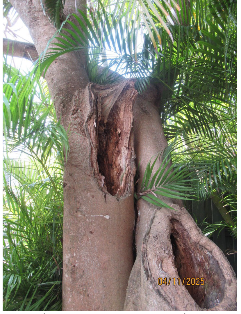
A photo of the hollowed trunk and a photo of damaged bark