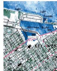
LOCATION MAP - NTS SEC. 25-T685-R25E