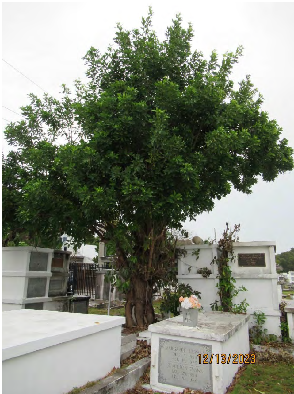
Photo of whole tree showing location, view 1.

Tree Species: Pink Tabebuia ( Tabebuia heterophylla )