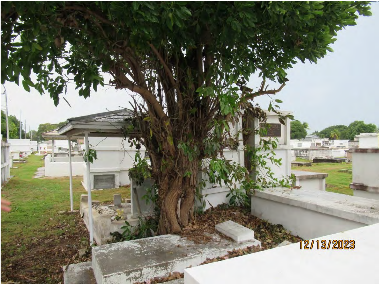
Photo of base and trunks of tree.