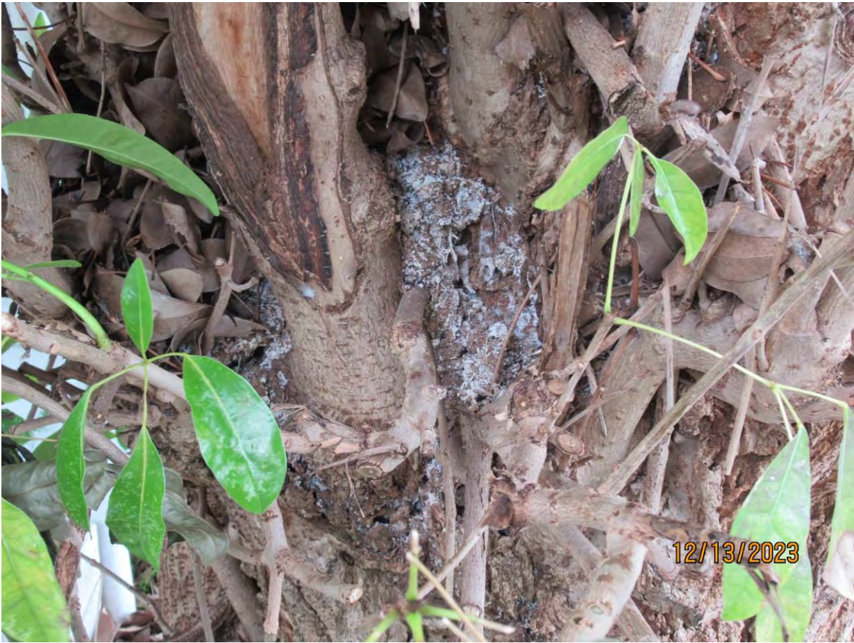
Photo of tree trunk showing decay and termite areas, view 2.