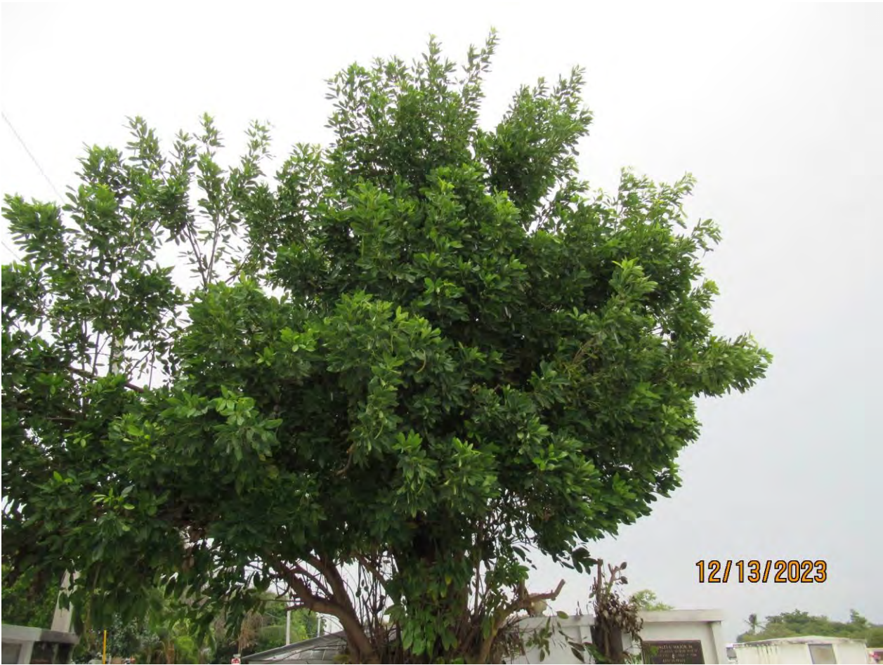
Photo of tree canopy.