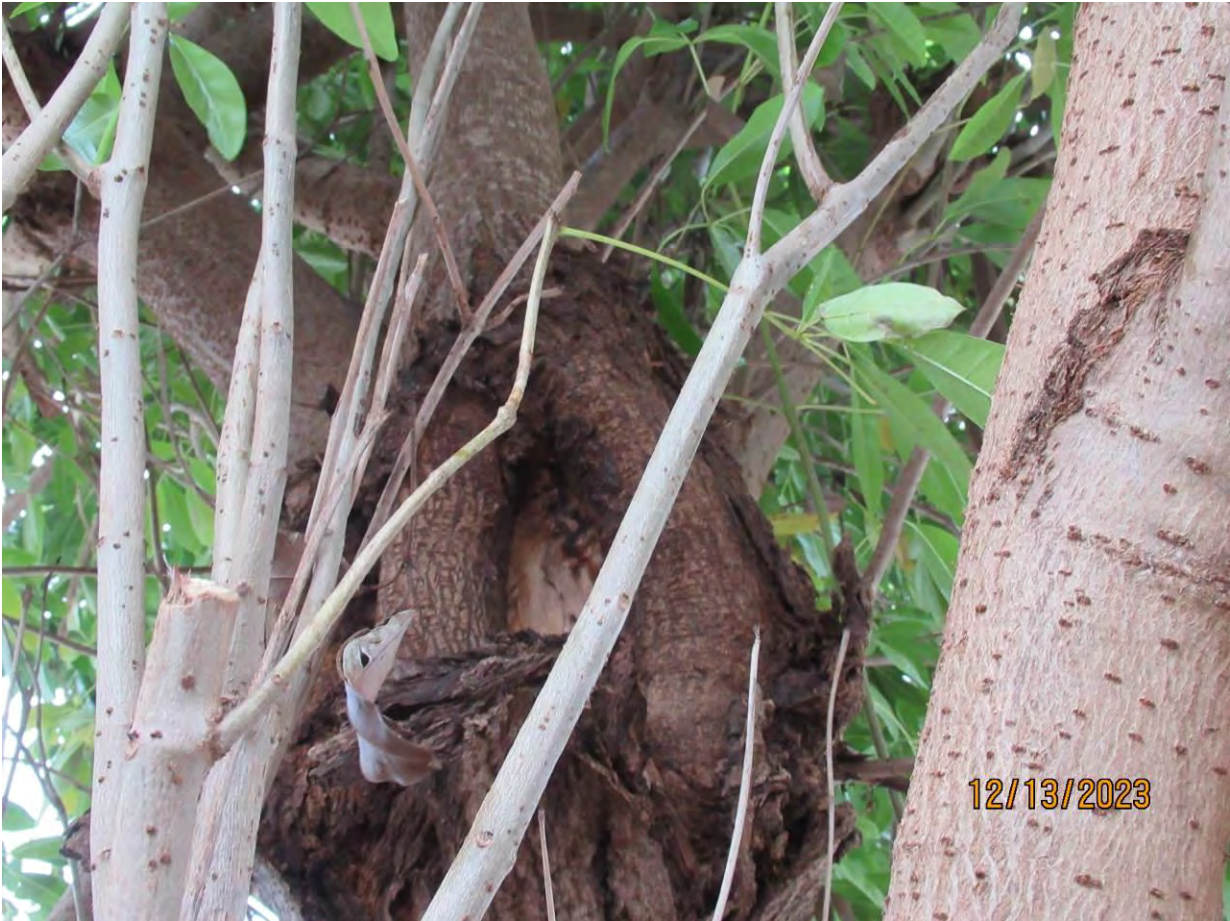
Photo of canopy trunk area showing decay and water sprout regrowth.