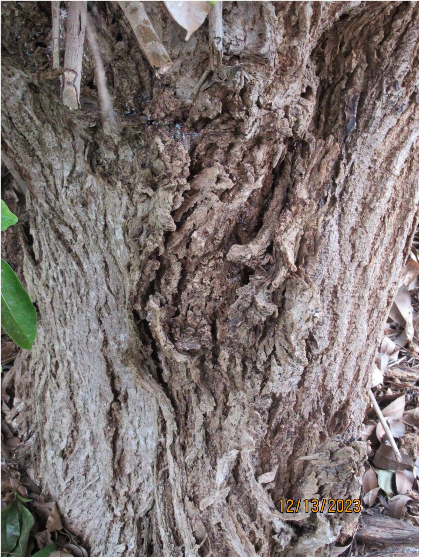
Photo of tree trunk showing decay and termite areas, view 1.