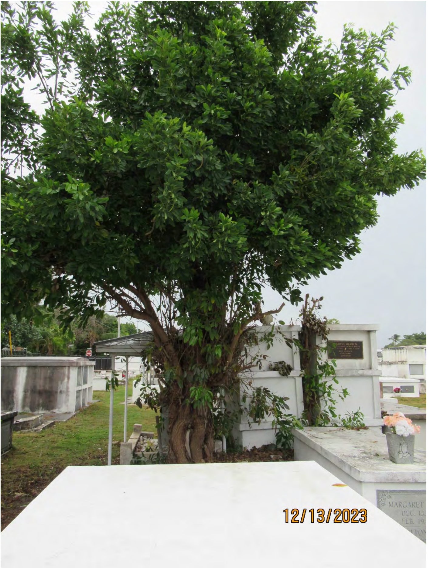
Photo of whole tree showing location, view 2.