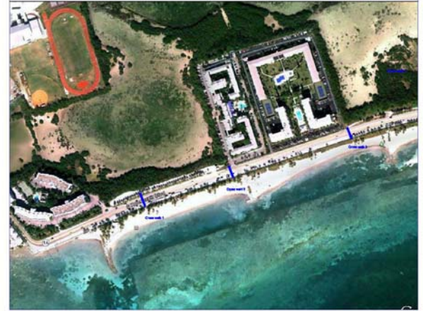
Proposed Cross walk locations