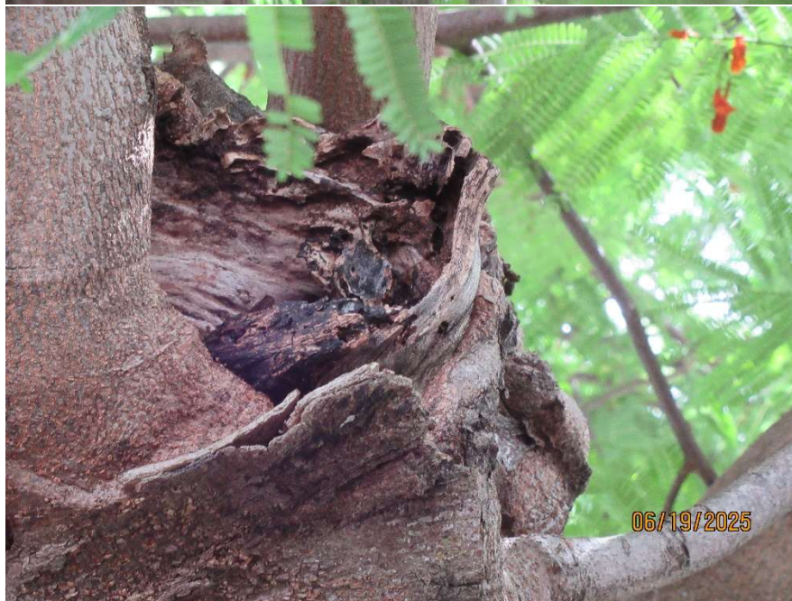
Tree has multiple large branches snapped off. None appear recent.