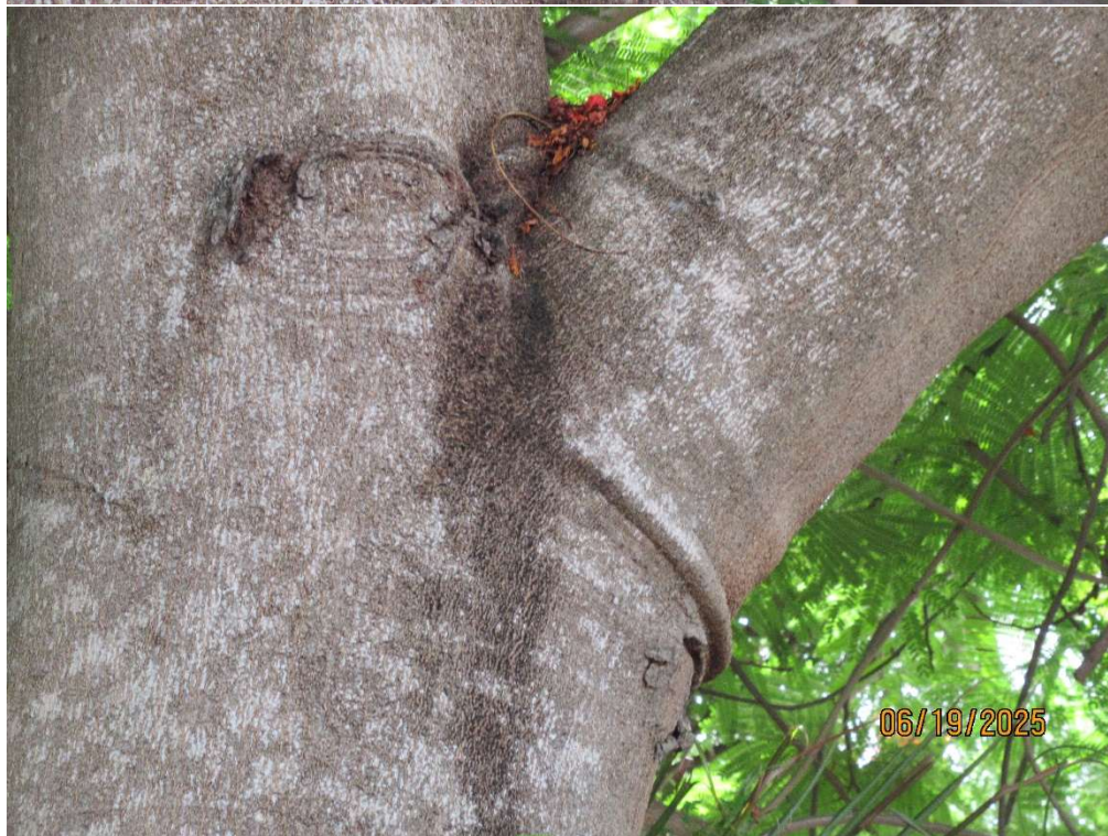
Top photo appears to be an old blister with burl and an adjacent sign of infection. Bottom photo shows wetwood caused by bacteria at the crotch above. Possible a sign of stress.