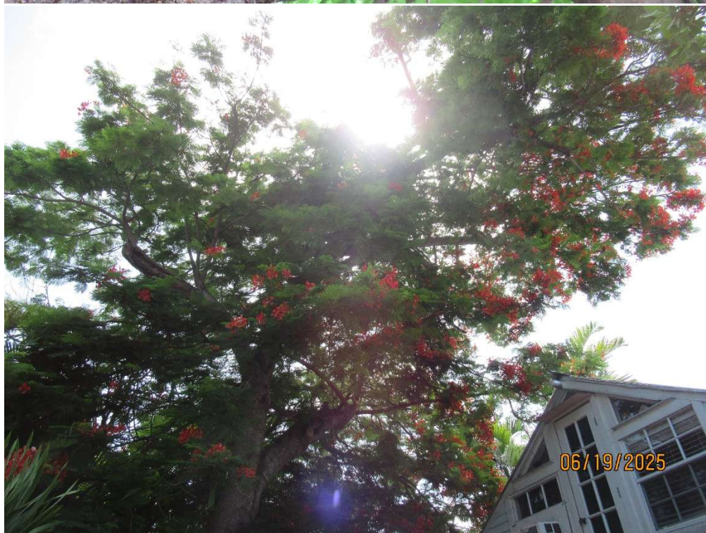
Top photo shows hole which was inaccessible. Bottom photo shows the tree canopy from back yard viewpoint.