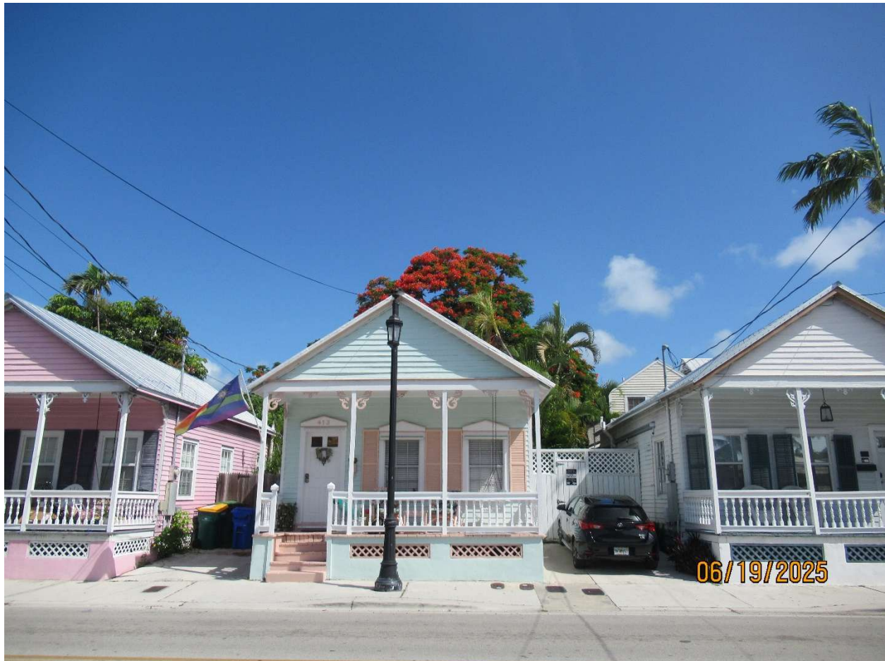
Tree canopy view looking at 413 Truman Ave.