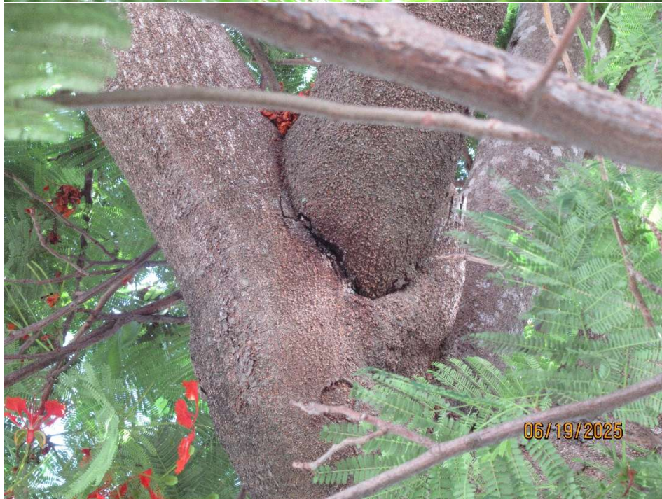
Bottom Photo shows a strange growth stem. No bark inclusion, but a small amount of dark matter near the crease. Does not appear to be healthy growth.