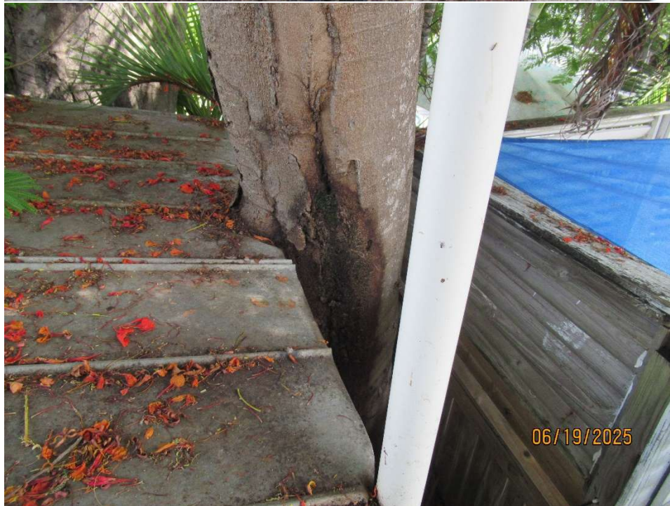
Top photo shows a close up of a wound on the trunk that appears infected and is leaking sap. The infection and discoloration flows down to the base of the trunk.