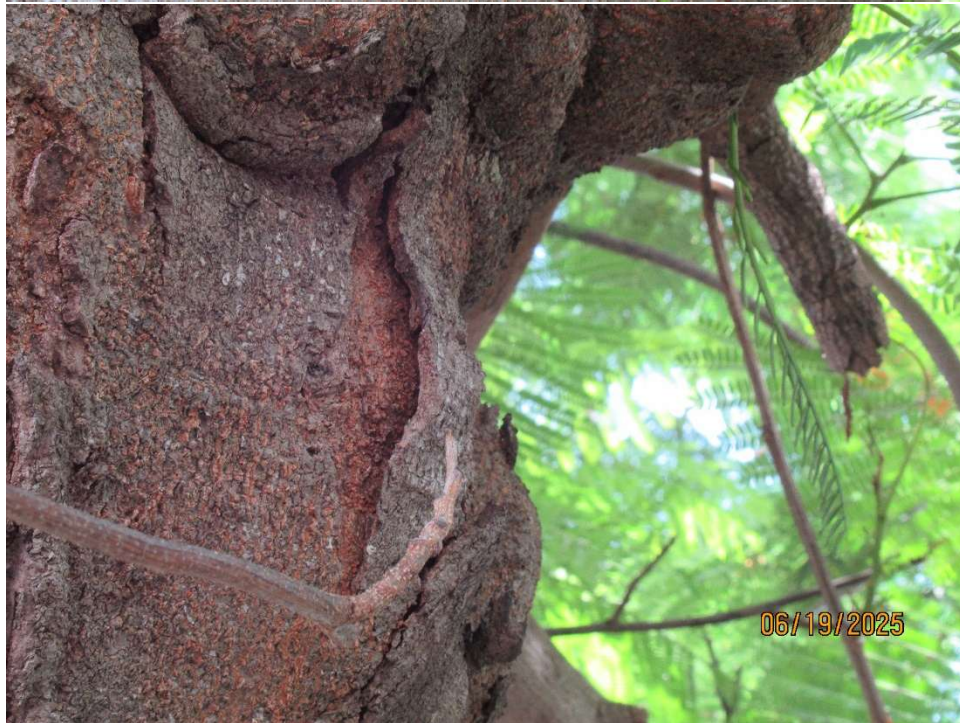
Top photo shows what appears to be an old blister that healed. Bottom photo more bark flaking and or cracking off.