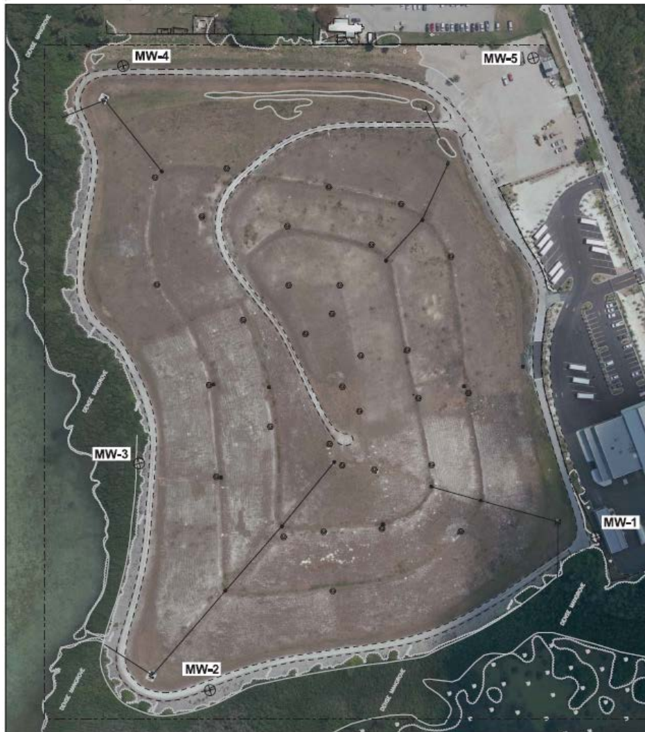
Figure 10: Groundwater Contours December 2015