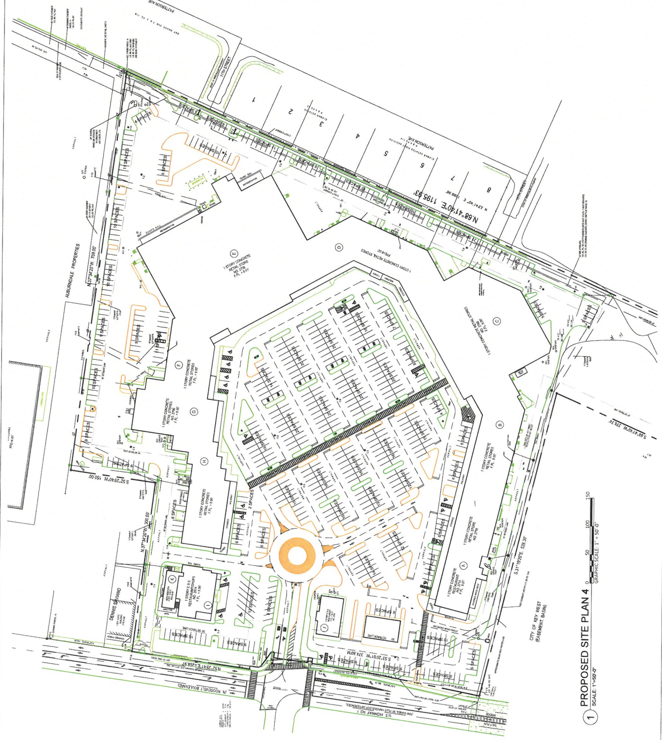
1 PROPOSED SITE PLAN 4 SCALE: 1" = 50'-0" GRAPHIC SCALE: 1" = 50'-0" 0 50 100 150

A2iA & MICHAEL B. INGRAM ARCHITECTURE 2814 NORTH ROOSEVELT BLVD. KEY WEST, FLORIDA 33040 TEL: 305.857.1111 WWW.A2IA.COM