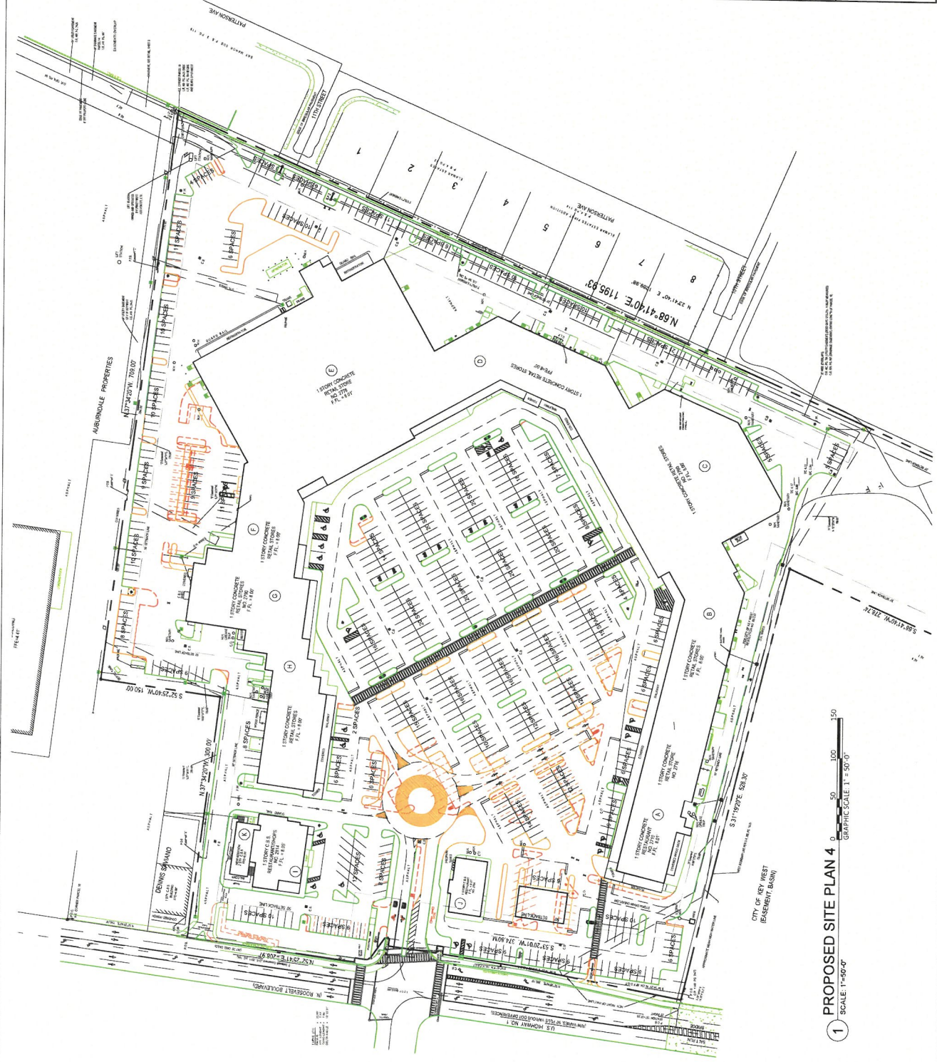
1 PROPOSED SITE PLAN 4 SCALE: 1" = 50'-0" GRAPHIC SCALE: 1" = 50'-0"