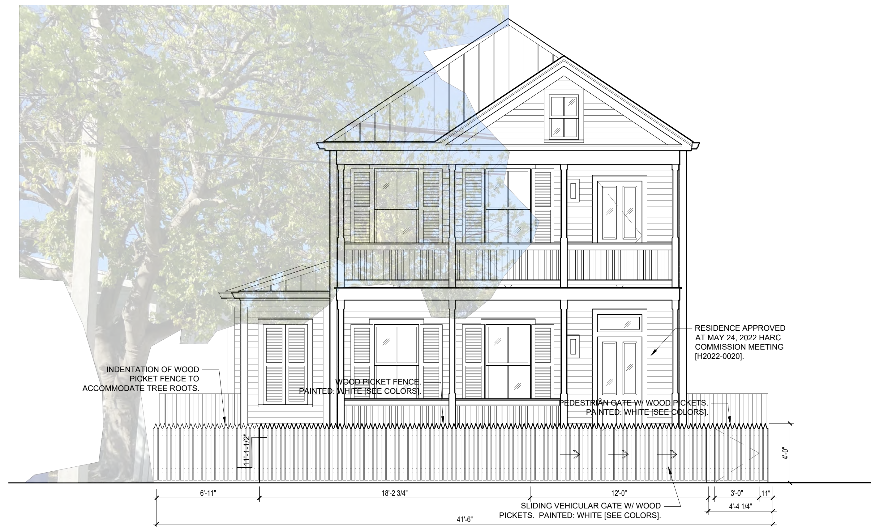
1 PROPOSED EAST / FRONT ELEVATION SCALE: 1/4" = 1'-0"