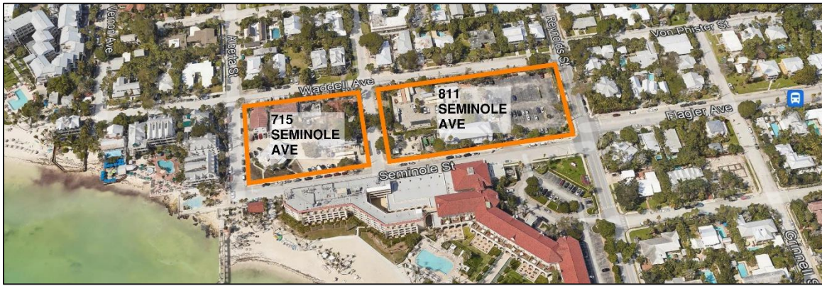
Aerial Map of the Subject Properties