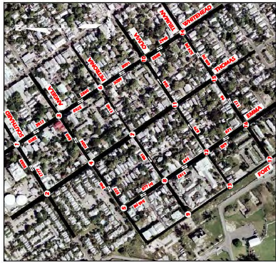
Figure 10: Existing Turning Movement Counts