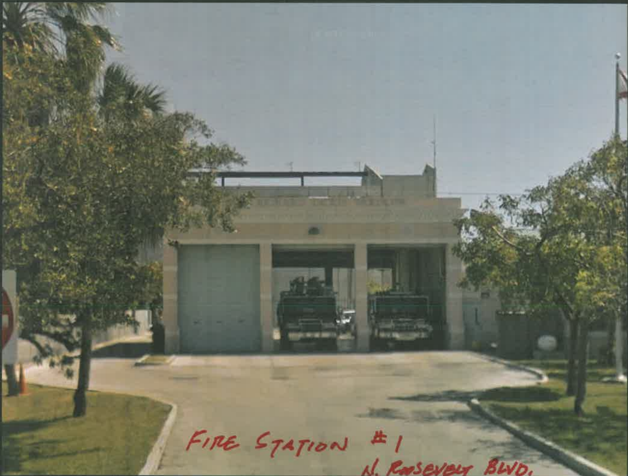
FIRE STATION #1 N. ROOSEVELT BLVD.