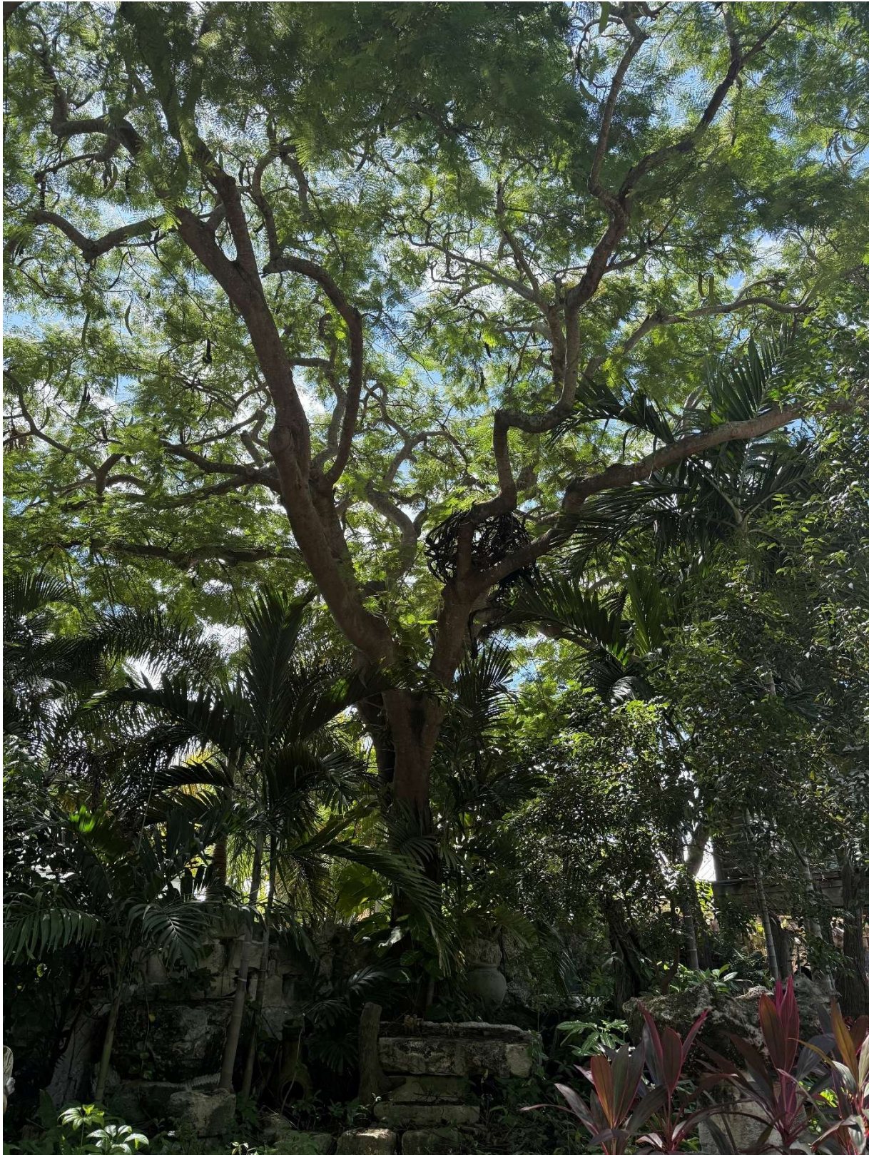
This Poinciana appears to have been well maintained.