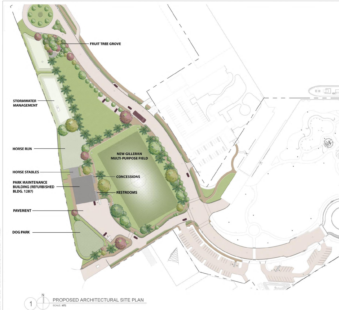
1 PROPOSED ARCHITECTURAL SITE PLAN SCALE: NTS

Original Phase 1B Estimate (2014): $10,000,000