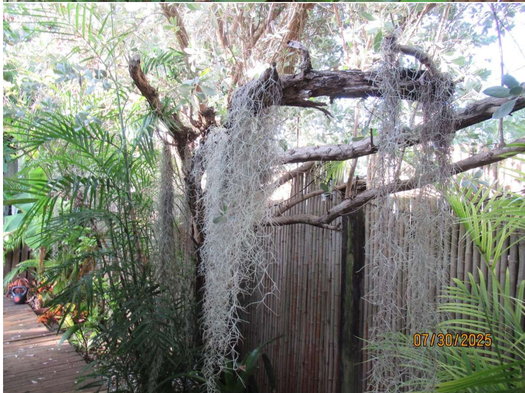
Top photo of 8" trunk which is the smaller of two trunks. Bottom photo shows midsection of tree standing in applicants side yard.