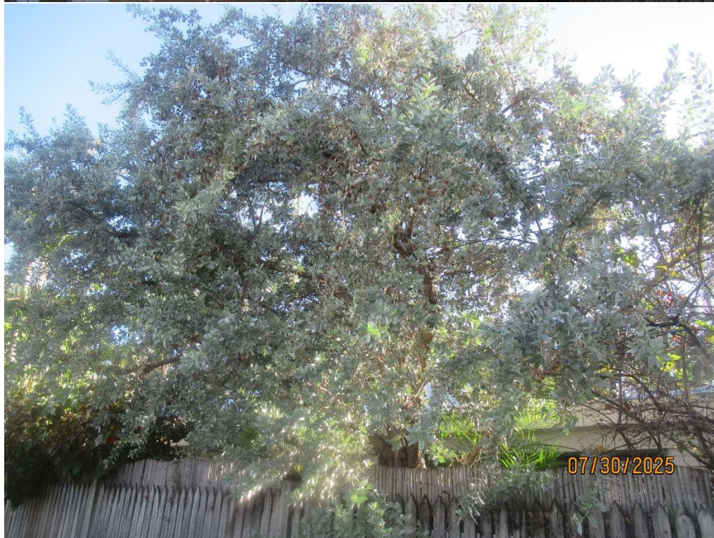
Top photo looking down side yard of applicants home. Bottom photo is standing in Watson St. facing tree.