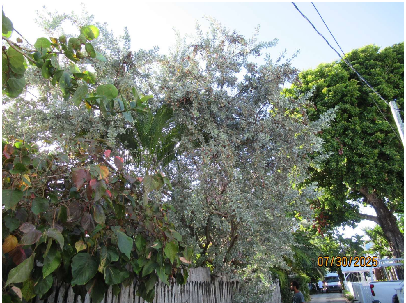
Tree view looking Southeast down Watson St.