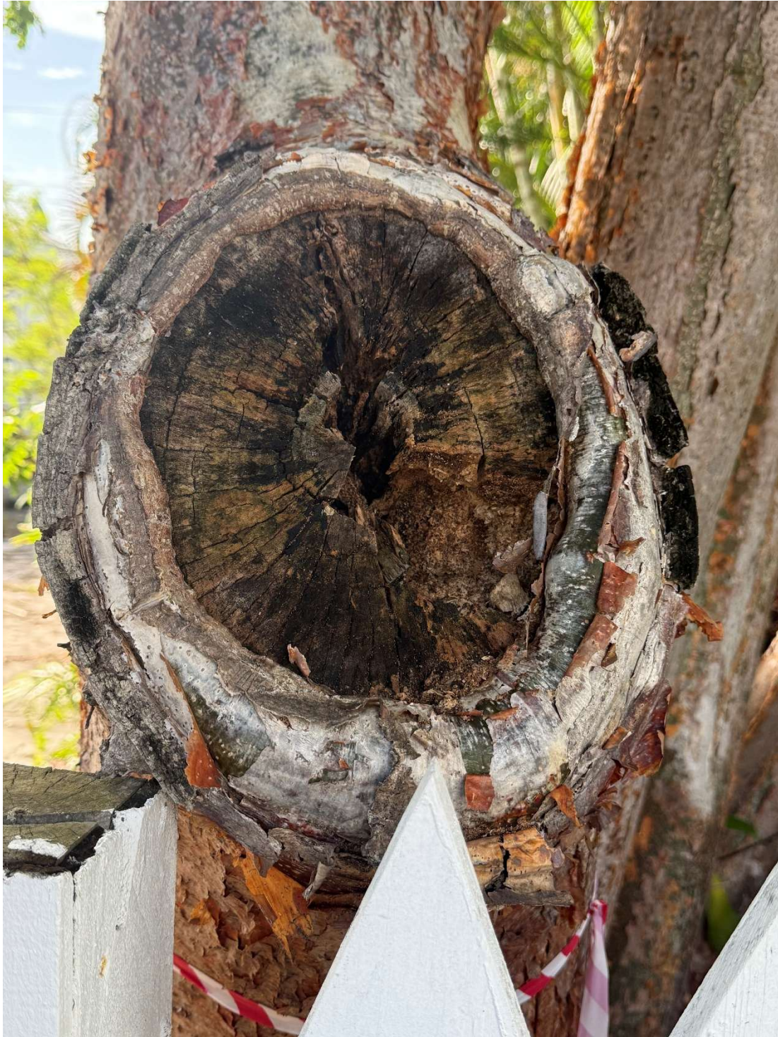
Close up of branch stump