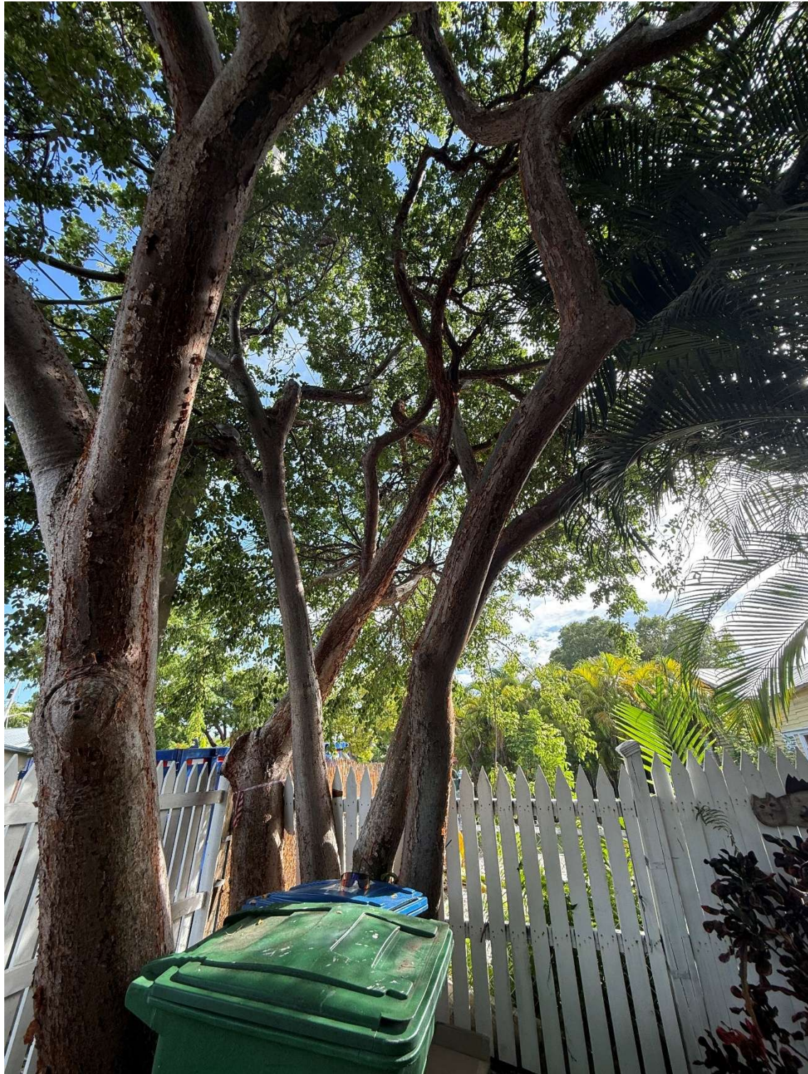
The combined canopy of 5 Gumbo Limbo trees.