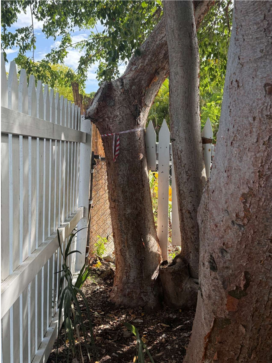
Subject tree shown in its immediate proximity to another gumbo limbo.