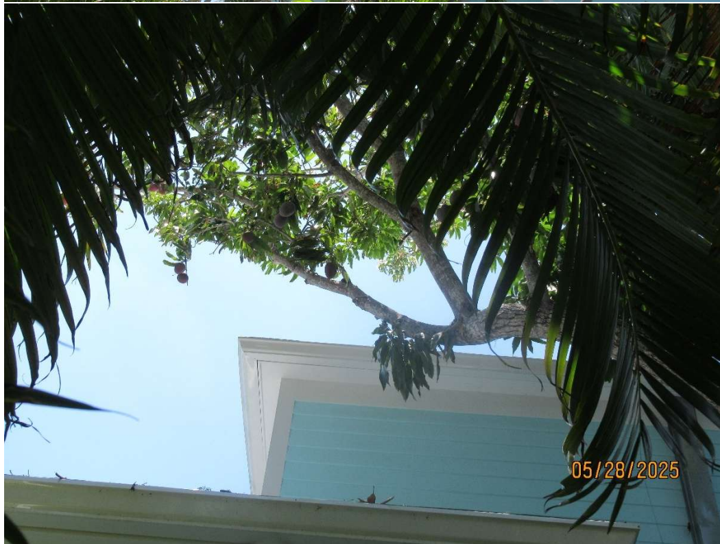
Top photo shows canopy being obscured by mature palms from the more visible Washington St side of property. Bottom photo shows branch hanging over roof.