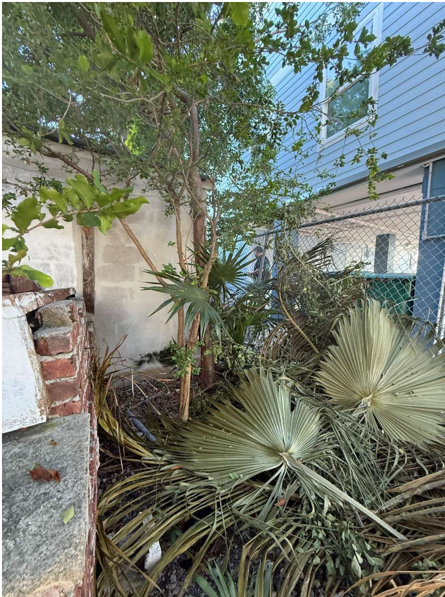
Barbados Cherry # 8 and Gumbo Limbo #9

REQUEST: The applicant is requesting removal of (1) Jamaican Dogwood Tree, (1) Royal Poinciana Tree, (1) Spanish Lime Tree, (1) Sapodilla Tree, (2) Strangler Fig Trees, (2) Gumbo Limbo Trees, (1) Barbados Cherry Tree