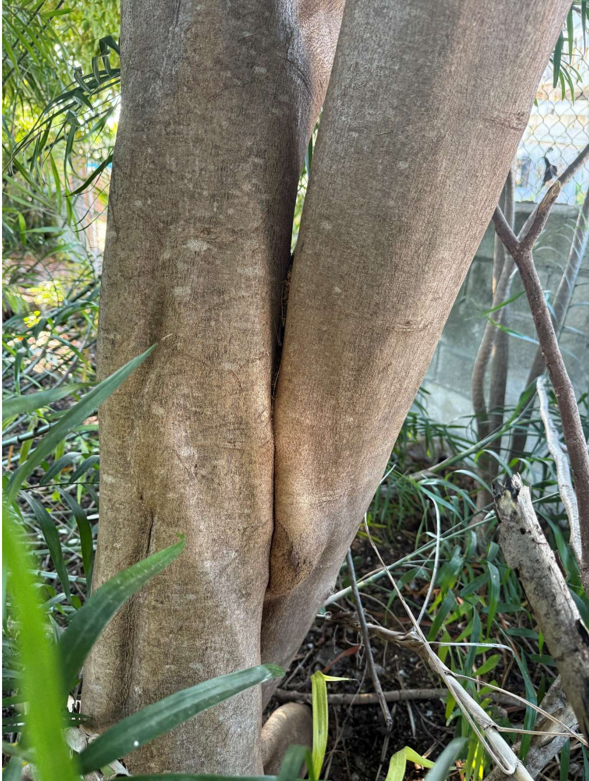
Royal Poinciana Tree #2 has compromised stems with included bark