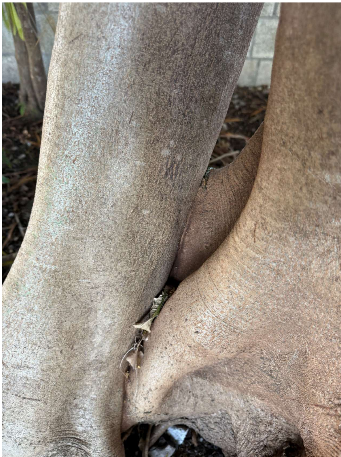
Poinciana Tree #2