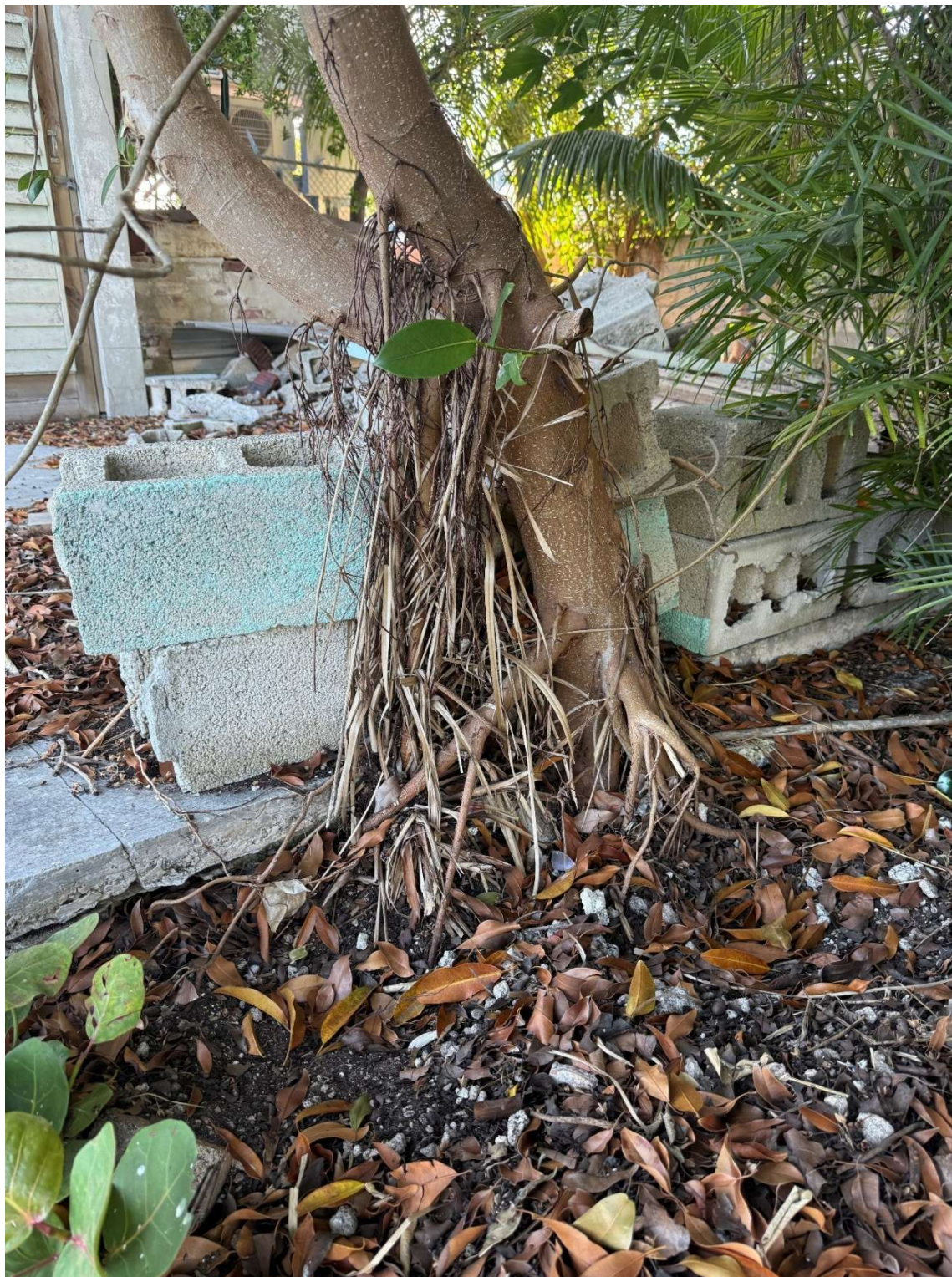
Strangler Fig #5