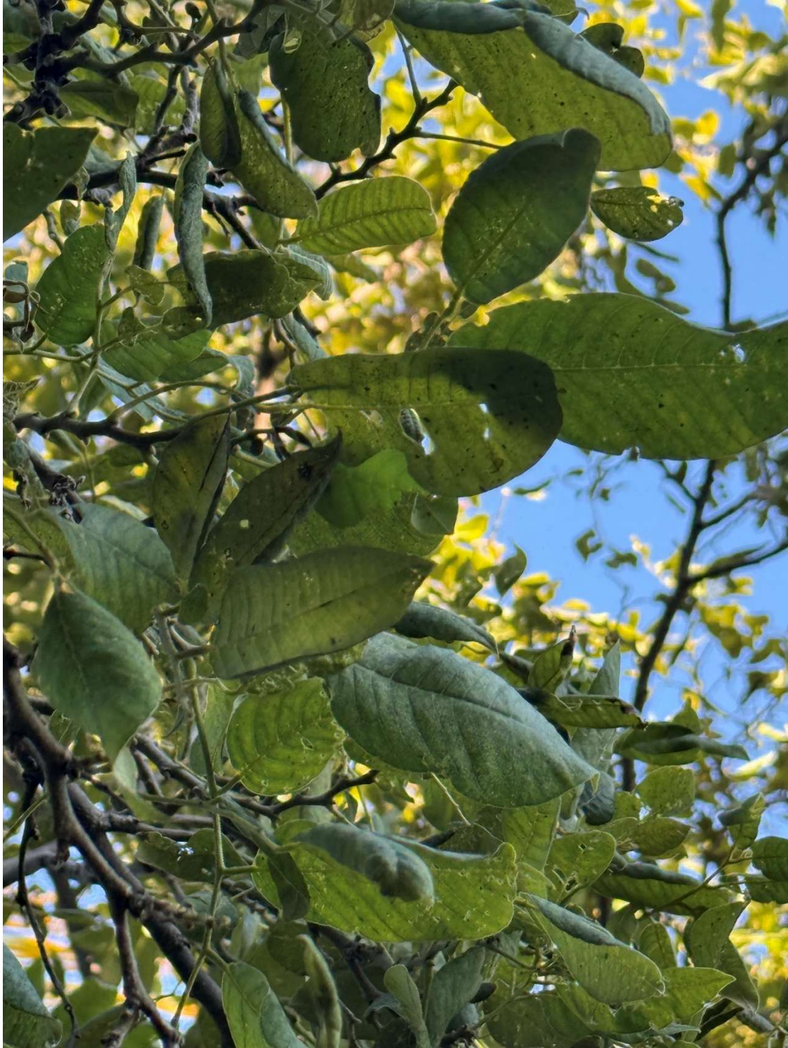
Jamaican Dogwood leaves and canopy are chlorotic and defoliated from pests.