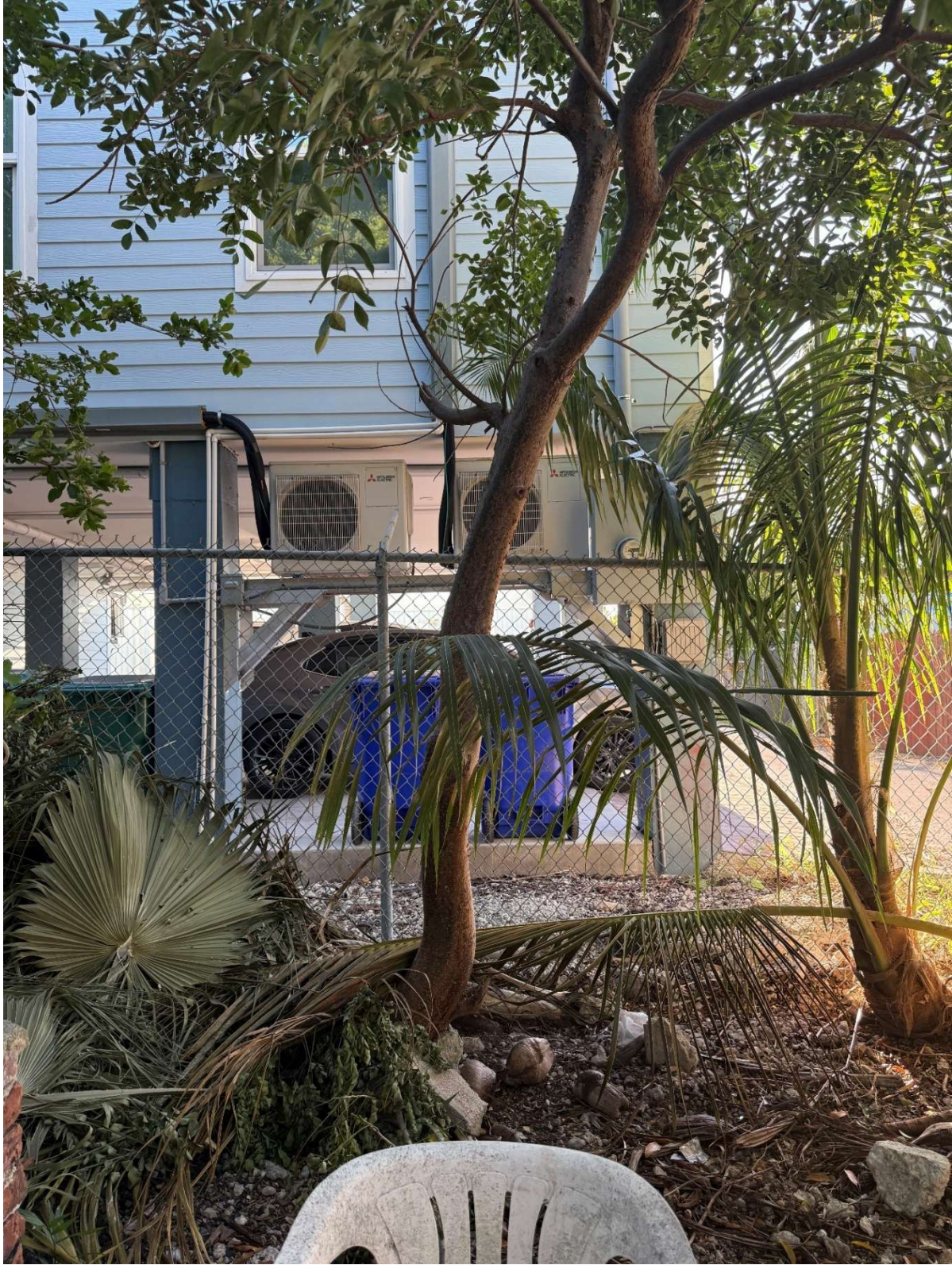
Gumbo Limbo #7