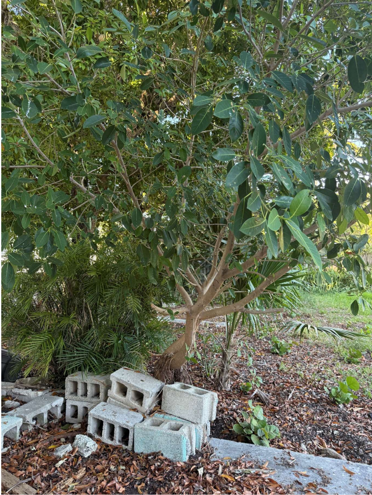
Strangler Fig #5