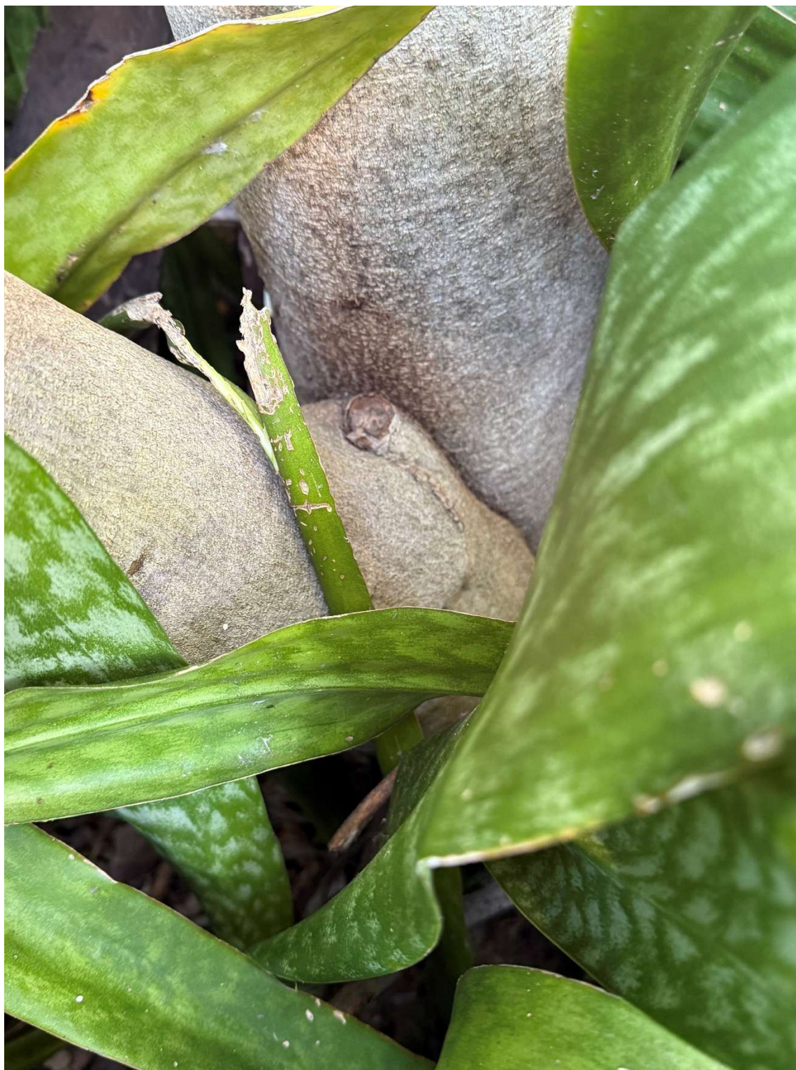
Jamaican Dogwood #1 stem also has included bark.