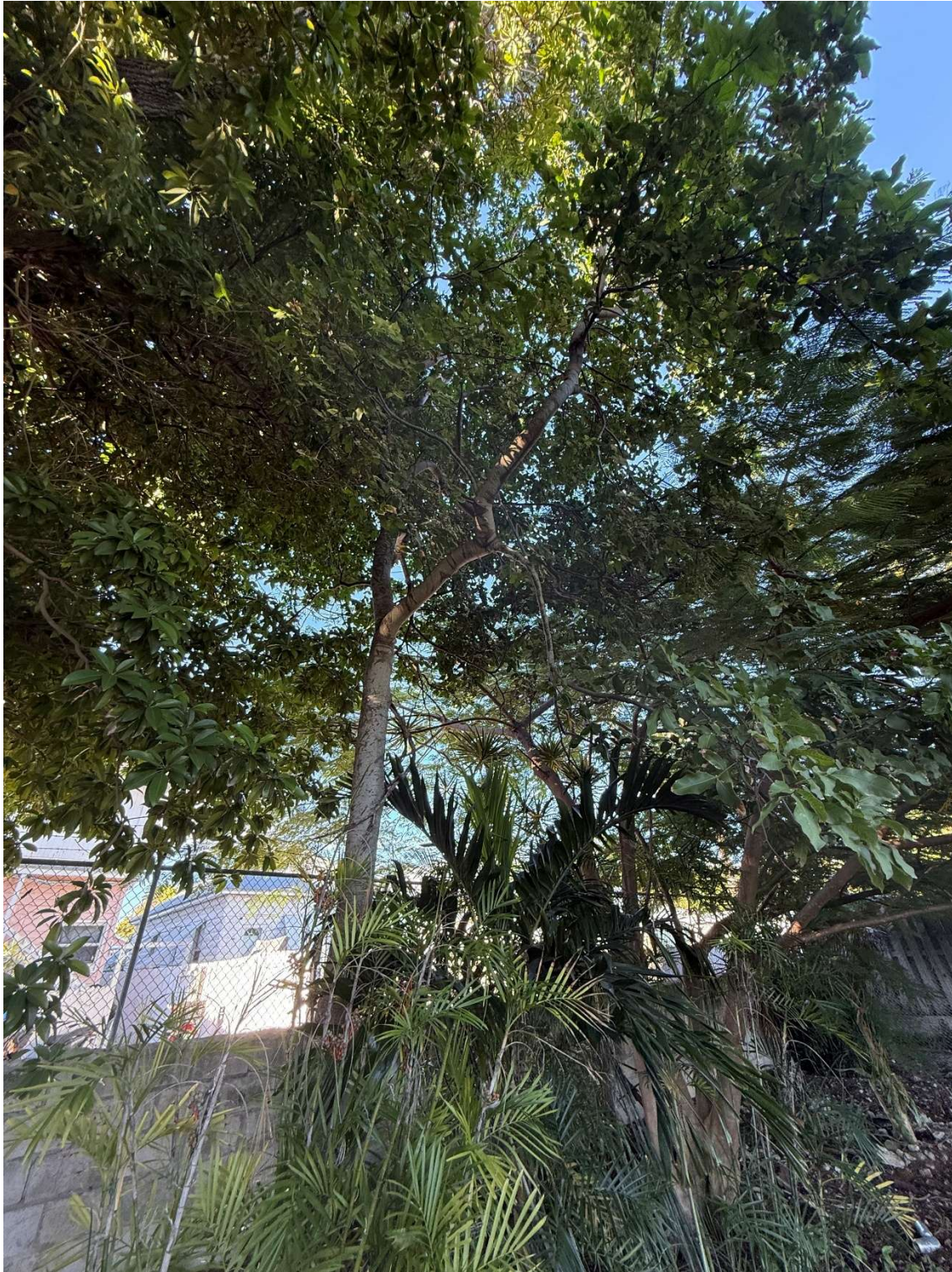
Spanish Lime Tree #3 smothered by Sapodilla and Royal Poinciana Tree