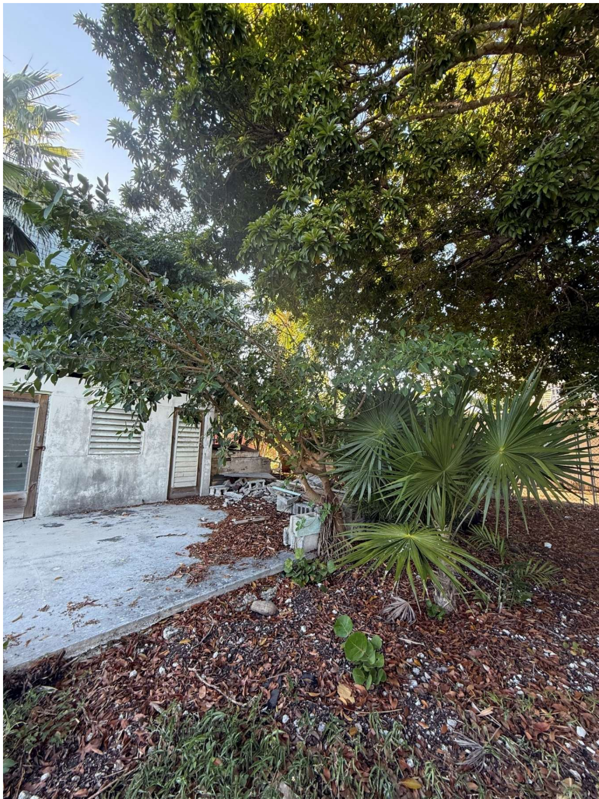
Strangler Fig #5