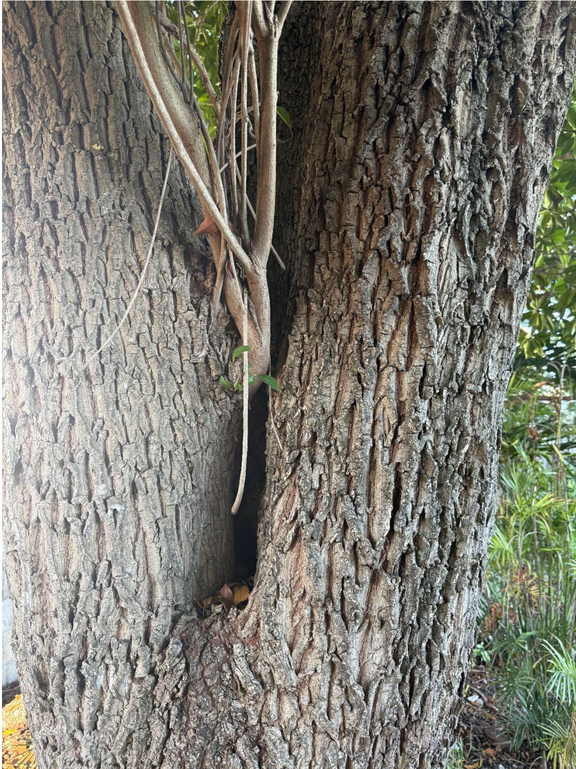
Sapodilla stem splitting into codominant stems