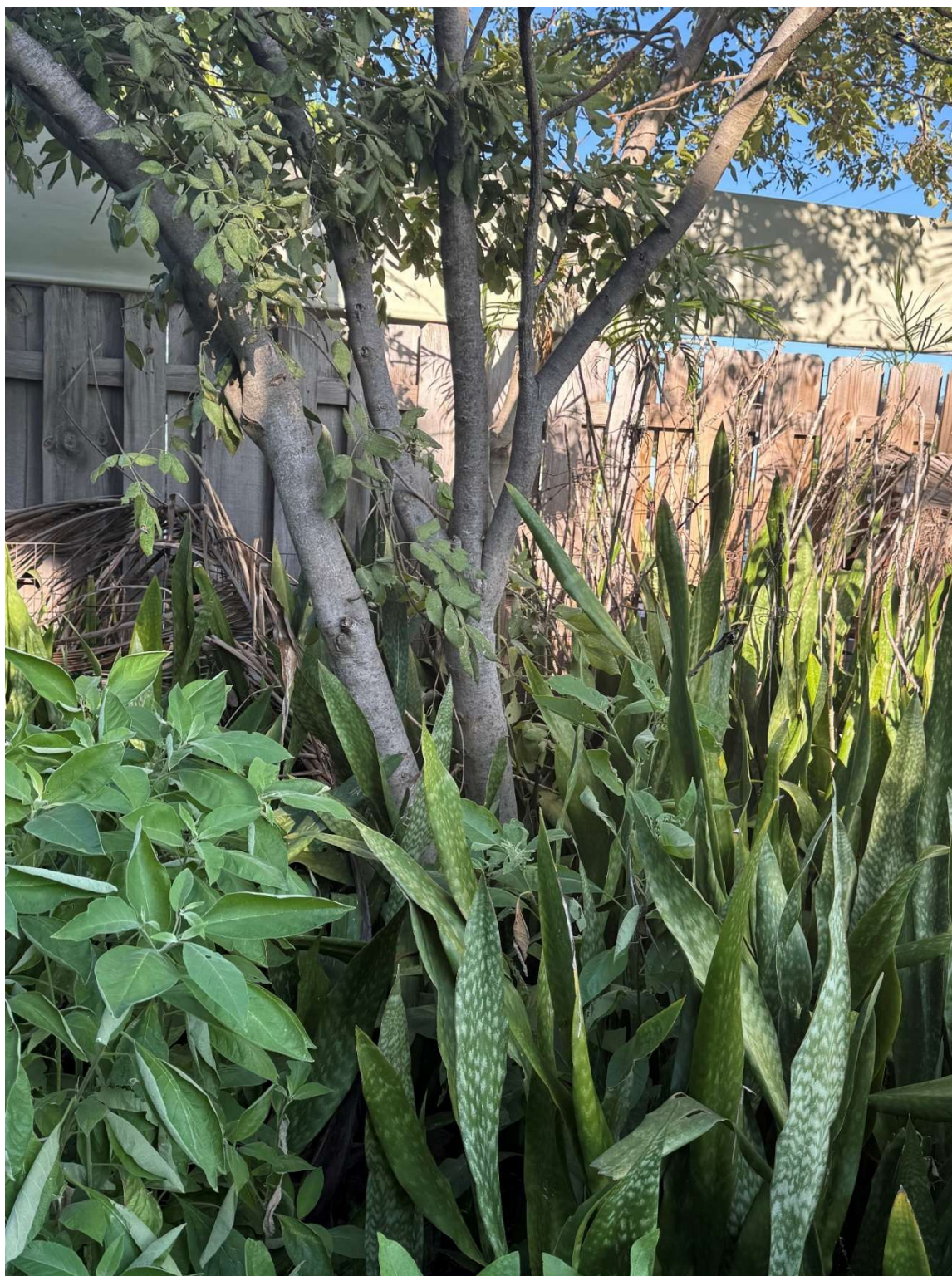
Jamaican Dogwood #1