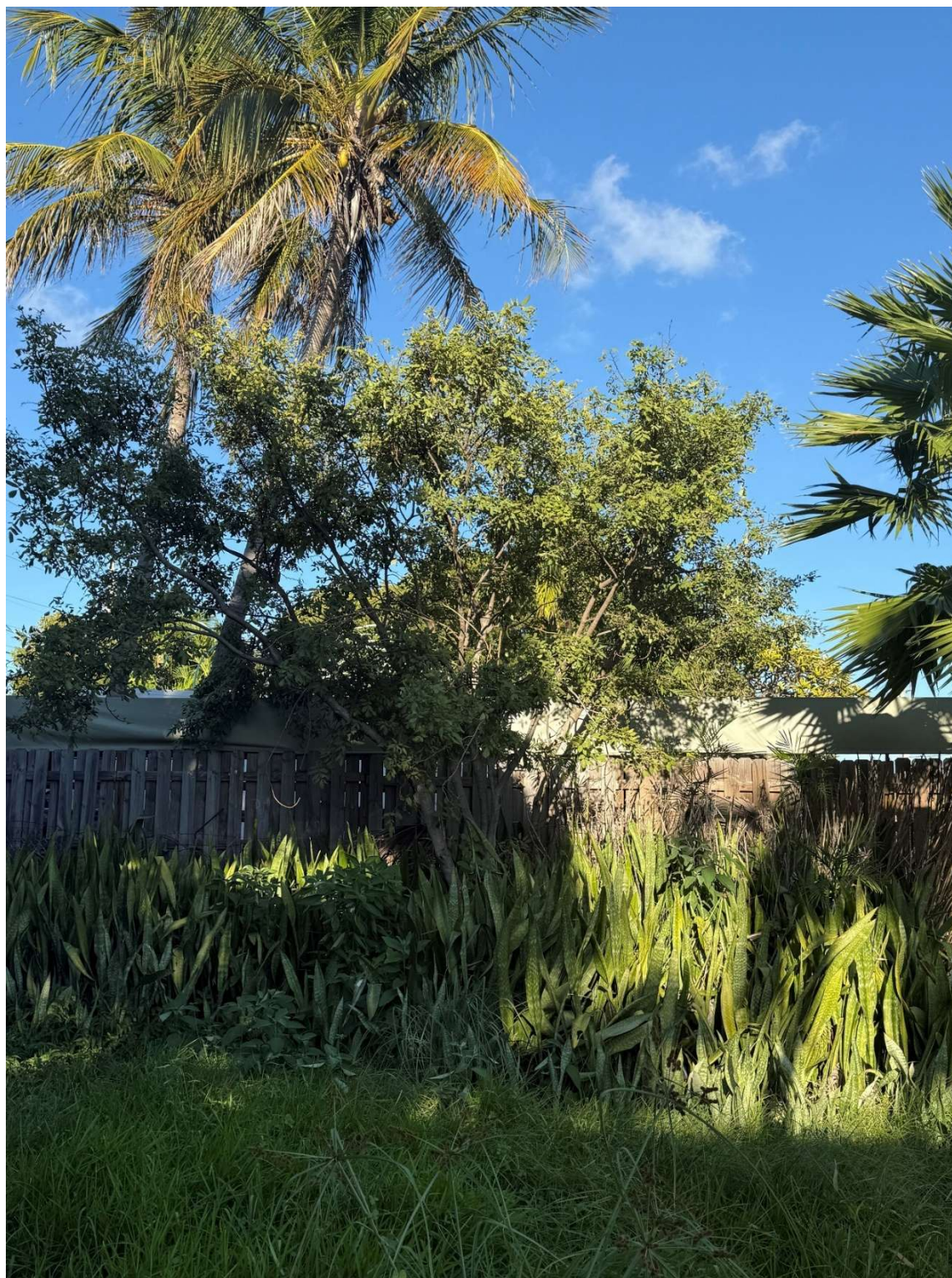
Jamaican dogwood Tree #1