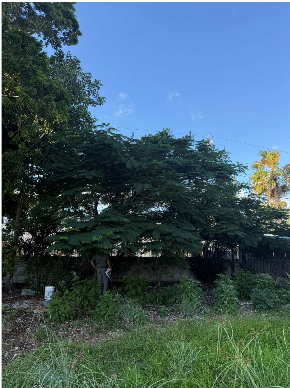
Poinciana Tree #2