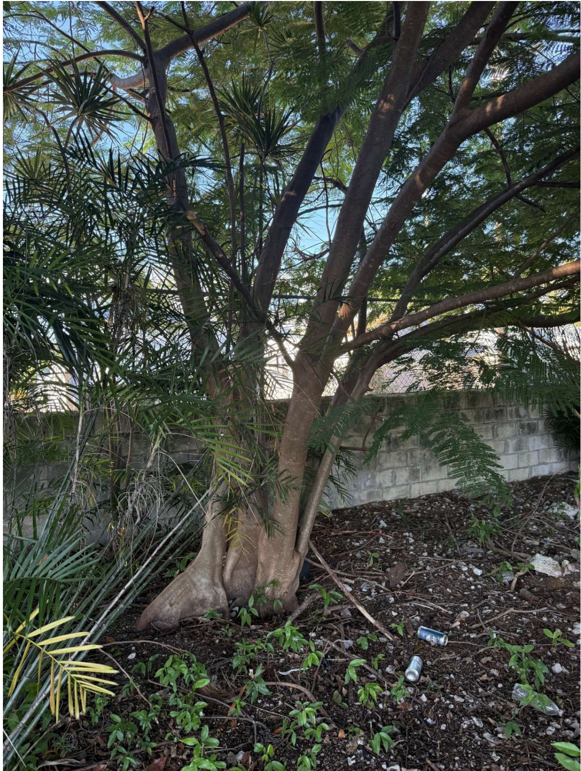
Royal Poinciana Tree #2