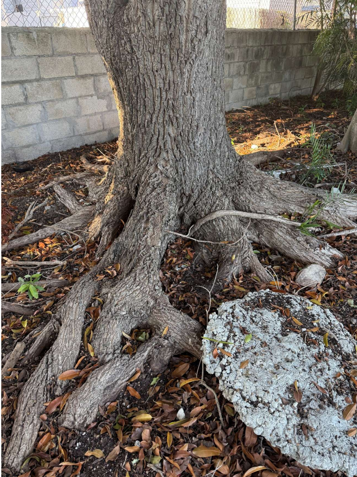
Sapodilla Tree #4 root flare and healthy aerial roots