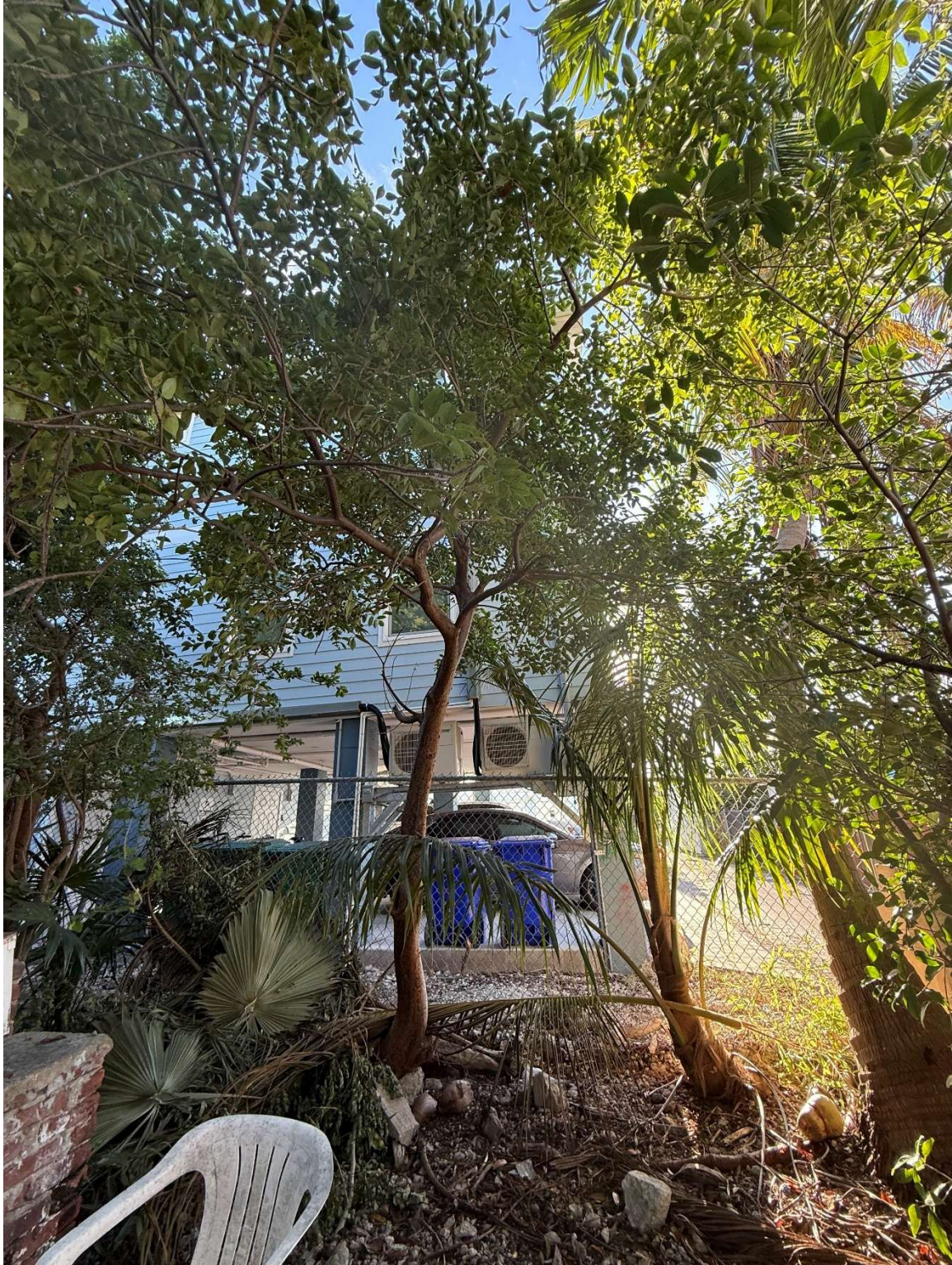
Gumbo Limbo #7