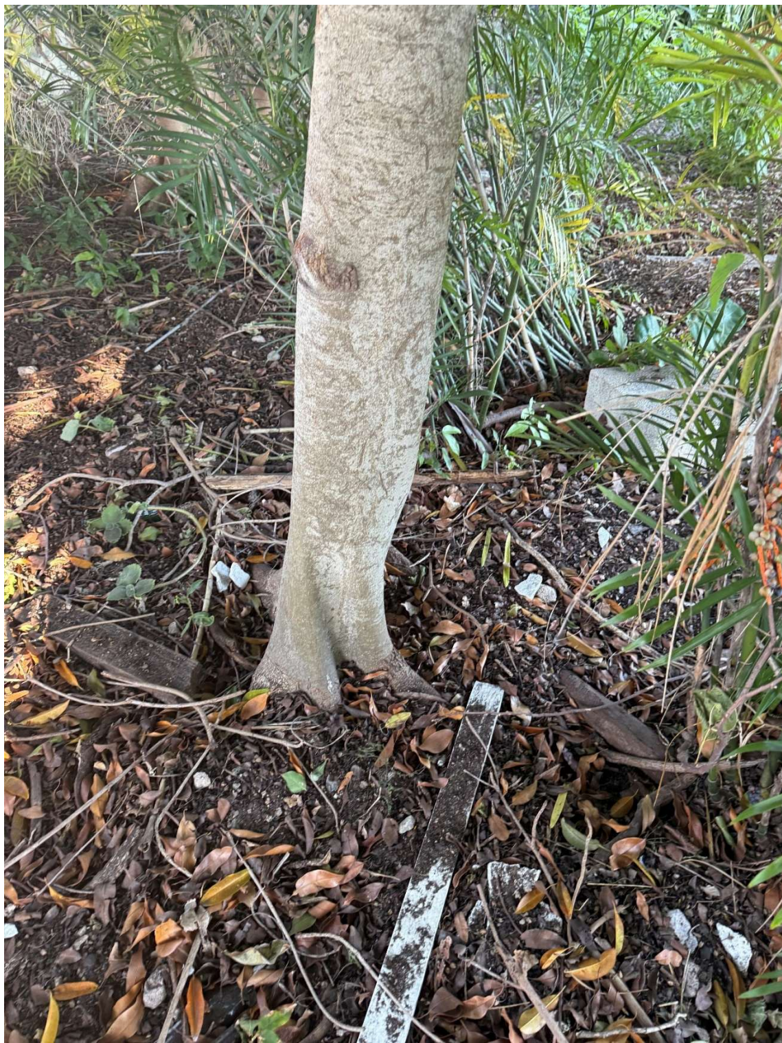
Spanish Lime Tree #3