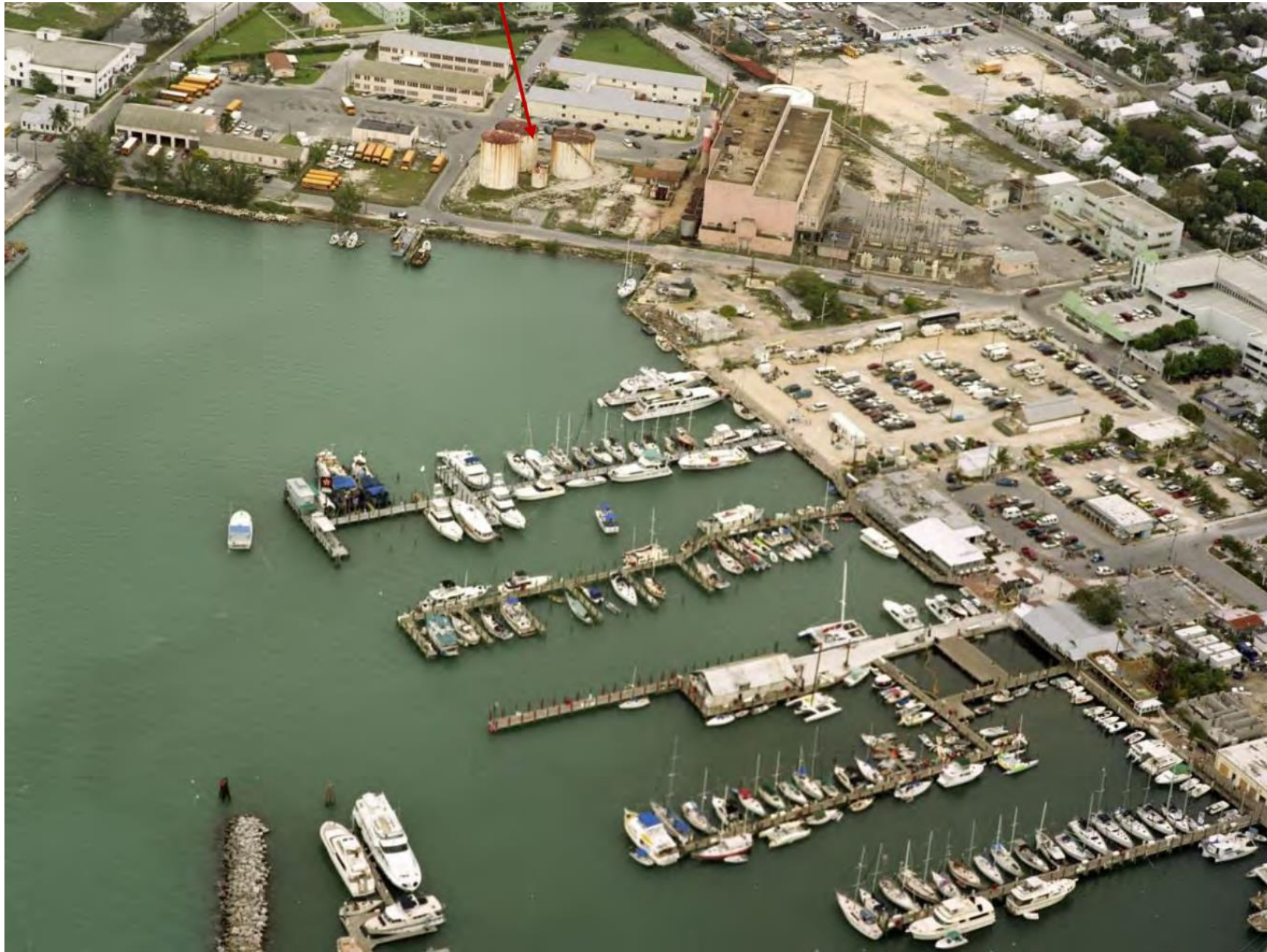
Aerial photograph circa 1990.