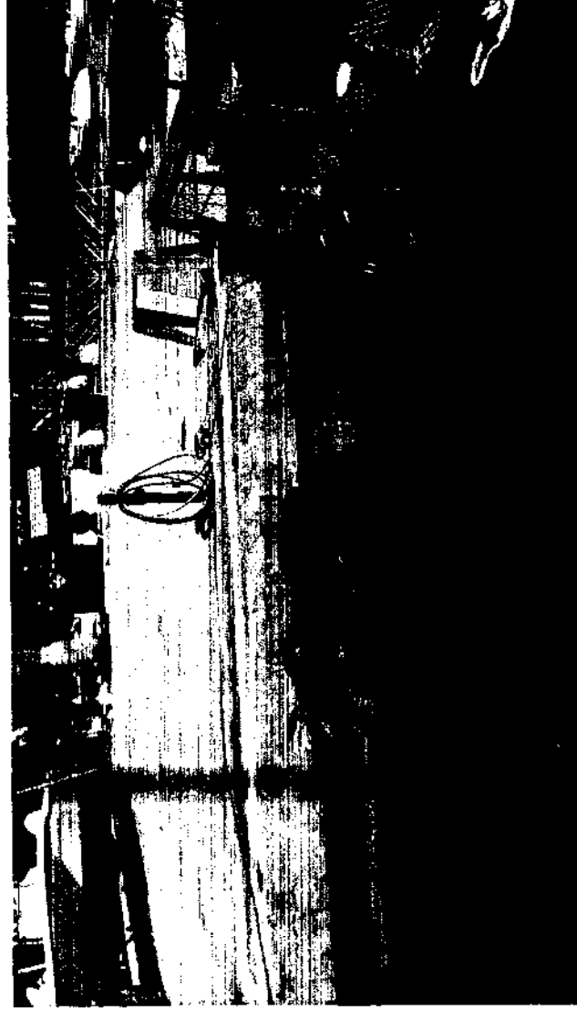
Figure 4. Concrete spalling, cracks and failure of seawall cap, soldier piles. Heavy silted dock basins require maintenance dredging.