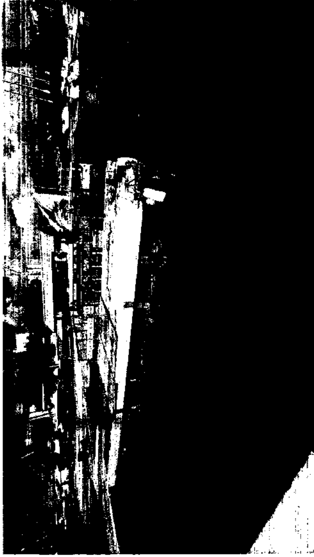
Figure 2. Severely damaged finger pier. Supporting gantry crane trucks. The core of the pier completely eroded backfill soils and seawall cap collapsed. Damaged seawall and soldier piles.