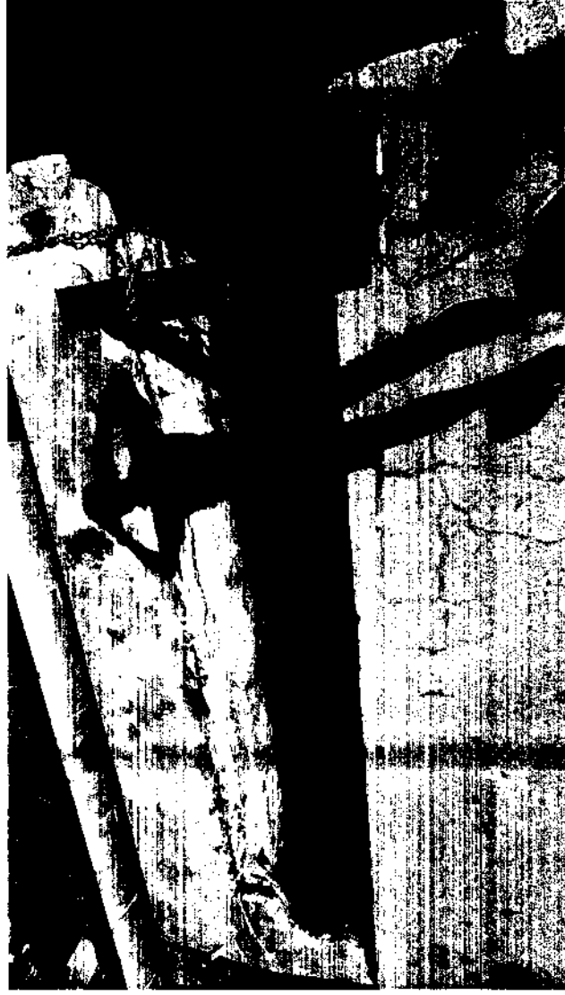
Figure 3. Same as Figure 2. Top view. Corroder reinforcement inside of the slab.