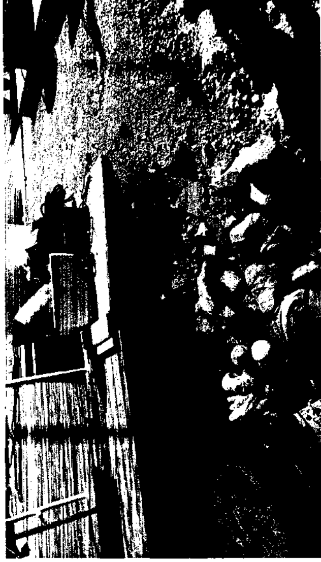
Figure 5. Lack of support and shoreline erosion along of wood frame dock. Old failing wood frame marginal dock abandoned under the new over framing.