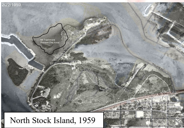
North Stock Island, 1959

North Stock Island was a dumping ground as early as the 1920's. Trash and large objects were often used as "filler" to create uplands from wetlands at this time and has been evidenced throughout Key West. Historic aerials (below) show the current footprint of the landfill was mostly water as late as 1963. In the 1950's the Stock Island Dump was operational, and trash was thrown in the easternmost corner (below, right) It is believed that trenches were dug, and fill was used as the base when it became a landfill in the late 1960's.