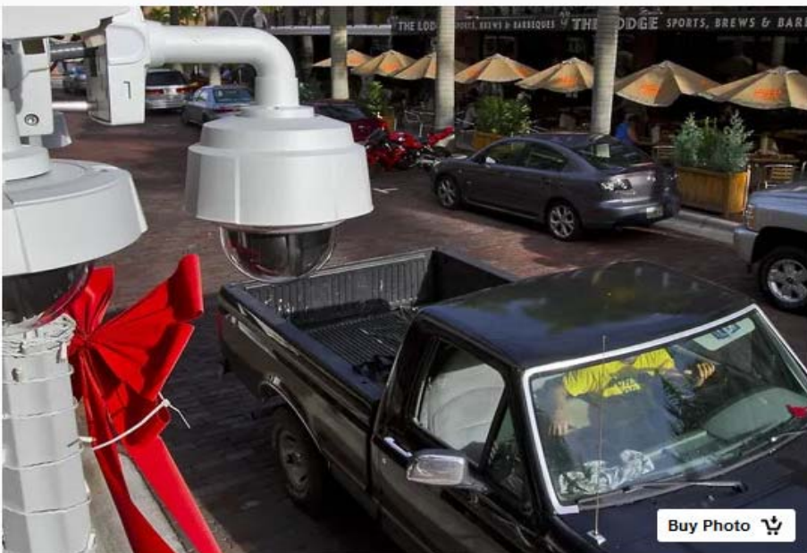
Tomas Duran, a technician with Integrated Fire and Security Solutions, install one of the surveillance cameras on First Street in Downtown Fort Myers, Wednesday afternoon (12/23/15).