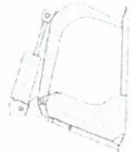
Industrial Fork Grapple