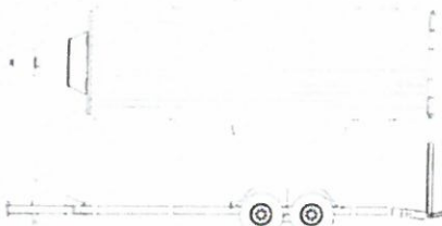
Shown with optional toolbox & 2' Dovetail.