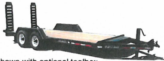
Shown with optional toolbox