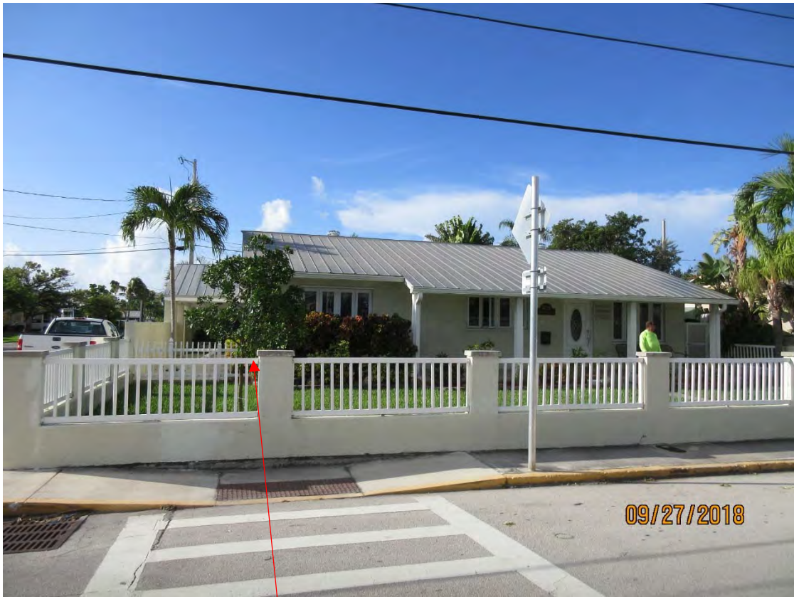
Third tree planted at 3720 Northside Drive.