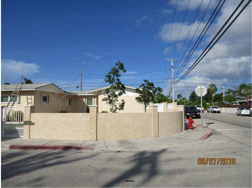
Two Cinnamon Bark trees at 1000 17 th St: one was already planted.