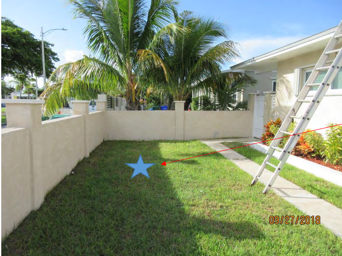
Approximate location of second tree planting at 1000 17 th St