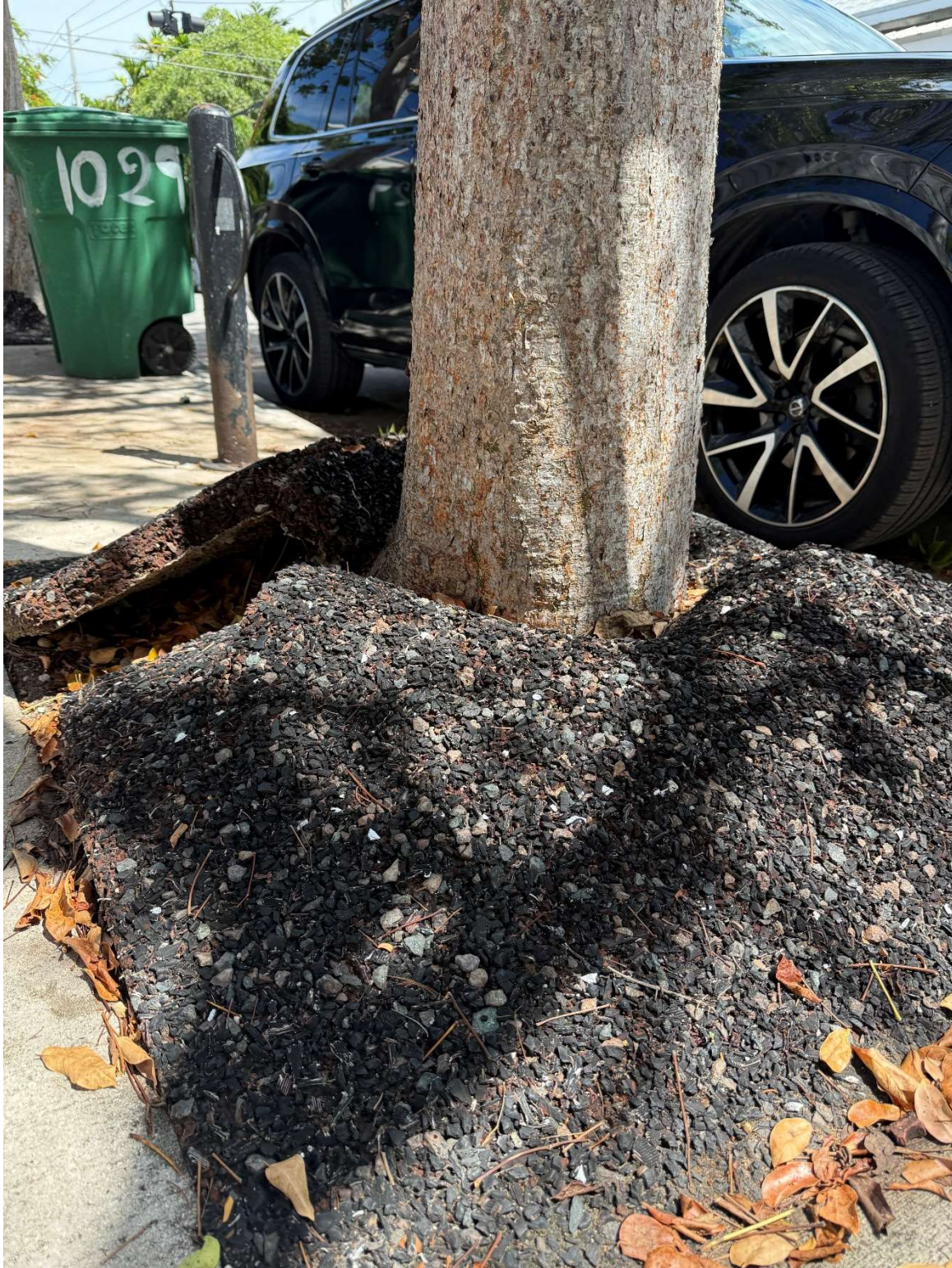
Gumbo Limbo Trees are large canopy trees and have no place being planted in small ROW planters surrounded by concrete.