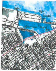
LOCATION MAP - NTS SEC. 25-T685-R25E