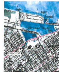
LOCATION MAP - NTS SEC. 25-T685-R25E